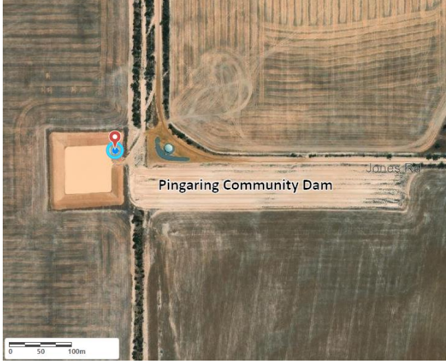
Aerial view Pingaring community dam