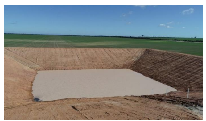
New dam (August 2020)