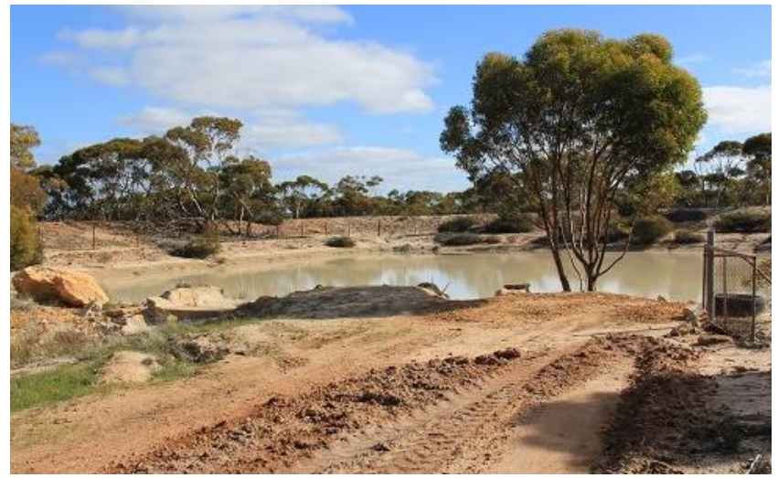
Pingaring East dam (August 2012)