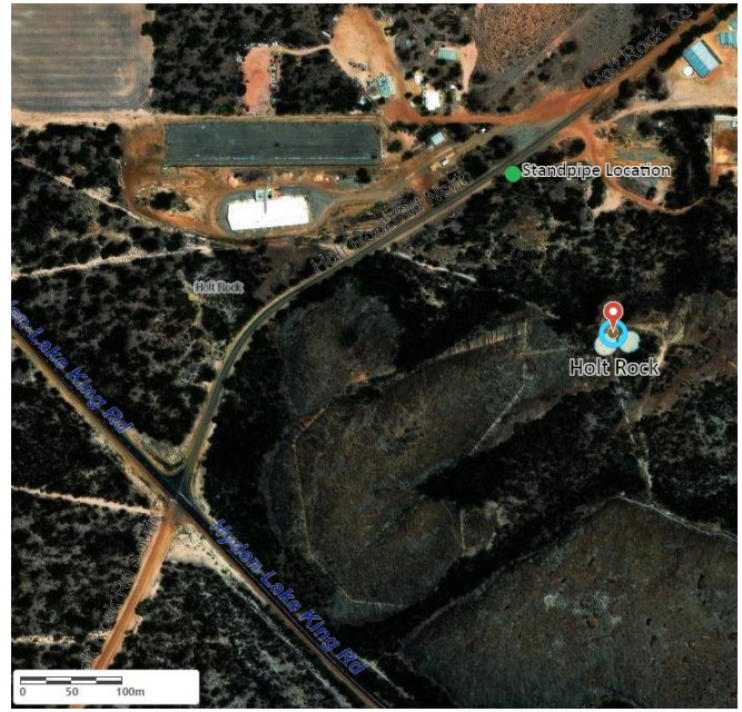
Aerial view of Holt Rock