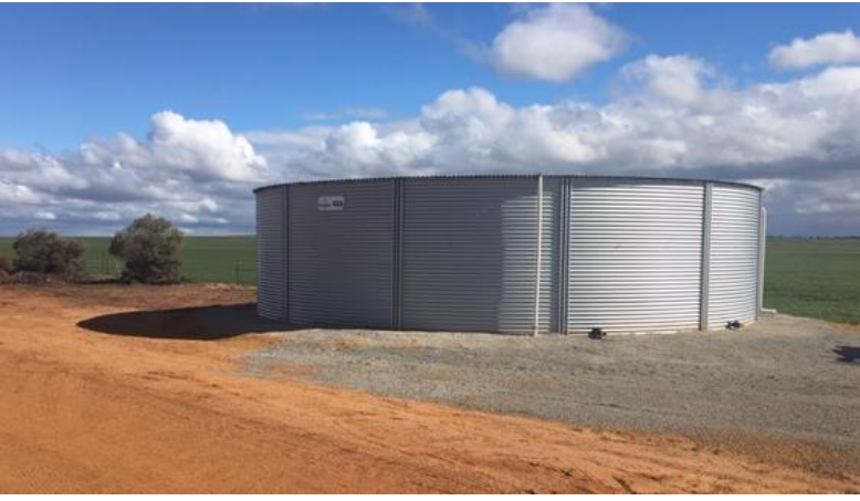
Henderson Road tank 310 kL