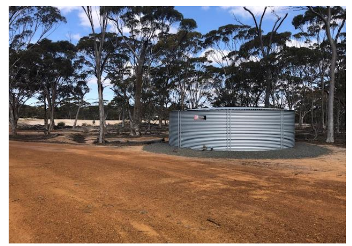
Dudinin dam tank