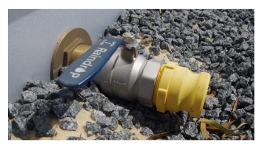
Tank standard camlock fitting

Below are examples of different fill points you may come across in the shire.