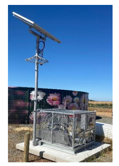
Tank, electric swipe card and pump for bore