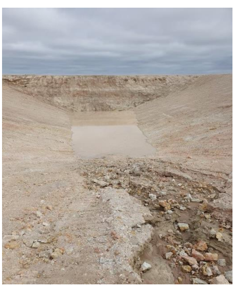
Desilted dam February 2023