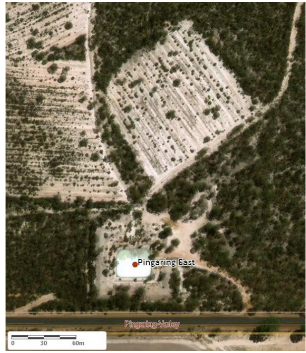
Aerial view of Pingaring East