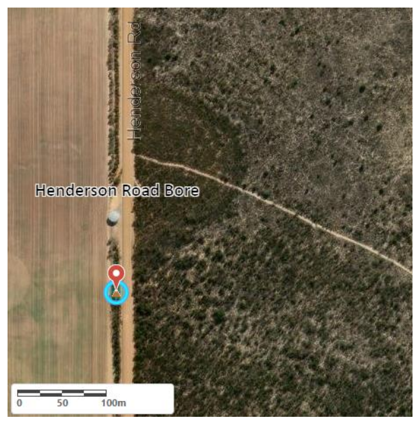
Aerial view of Henderson Road