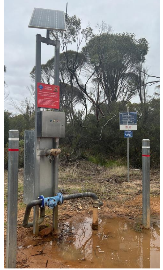
Standpipe and swipecard (2022)