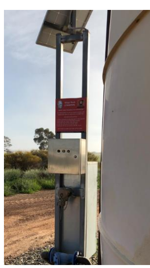
Swipe card standpipe system