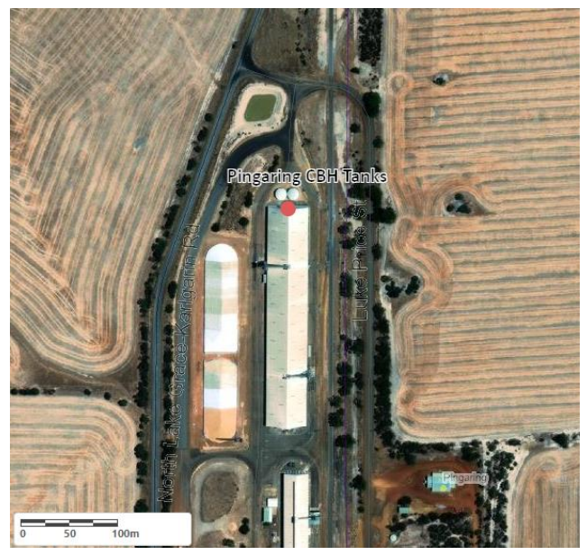
Aerial view of Pingaring CBH tanks