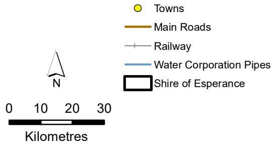
Strategic Community Water Supplies