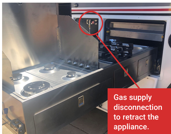
Figure 2 – Example of slide out kitchen.