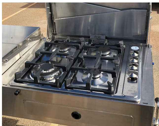
Figure 4 – Example of slide out cooker.