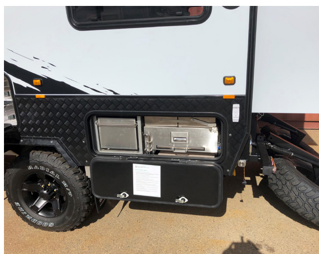
Figure 5 – Example of a cooker in its stowed position.

Department of Local Government, Industry Regulation and Safety www.lgirs.wa.gov.au