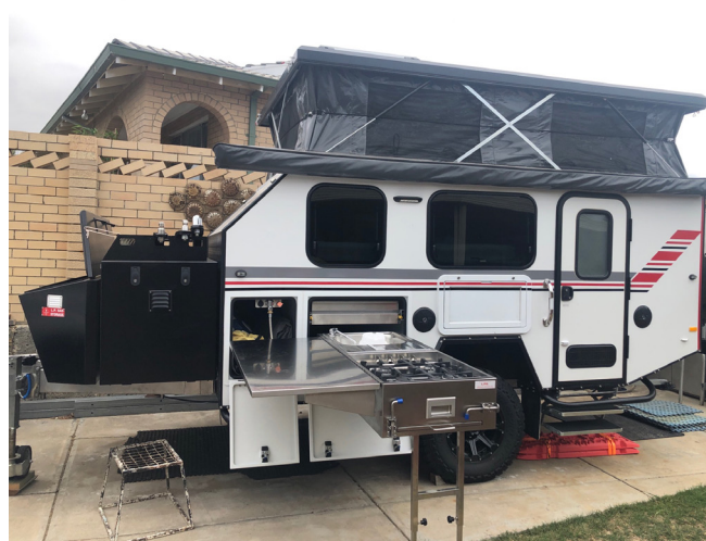
Figure 3 - Example of slide out kitchen.