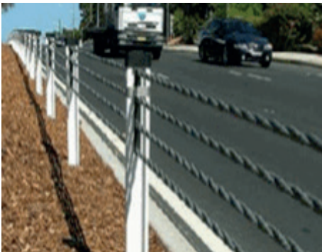
Flexible Wire Barrier