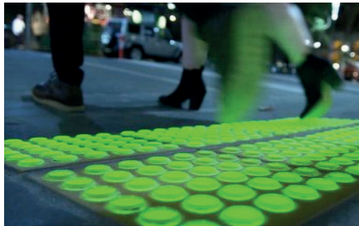
Image Four, Melbourne In-Ground Traffic Light

There are also measures that may assist distracted pedestrians while crossing the road. New South Wales and Victoria are currently conducting trials of in-ground traffic lights so that pedestrians looking downwards (at mobile phones) still see the lights.