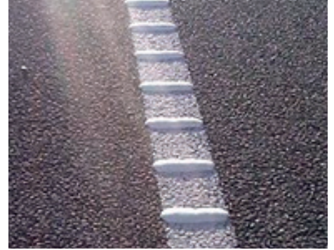
Tactile Audible Road Markings

There are also measures that may assist distracted pedestrians while crossing the road. New South Wales and Victoria are currently conducting trials of in-ground traffic lights so that pedestrians looking downwards (at mobile phones) still see the lights.