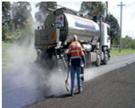
Road Shoulder Widening