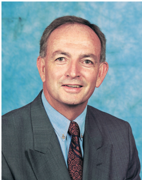
Hon Tom Stephens MLC

The Buy Local Policy aims to maximise supply opportunities for competitive local Western Australian businesses when bidding for State government contracts. The Policy supports other government initiatives to attract new investment, encourage employment creation and growth and to stimulate sustainable industry development within Western Australia.