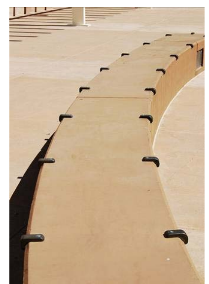
Figure 3: Anti-skateboard fixings must be vandal resistant.

In cases where skating is permitted designs should