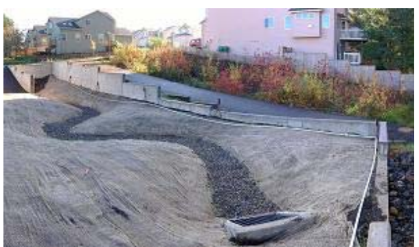
Figure 2: Two bio-swales for a housing development. The one in the foreground is under construction, while the one in the background is already established.

Bio-swales are an open and usually marshy drainage course. They are designed to slow the flow of water to allow silt and other impurities to settle out before the water enters the stormwater drainage system. Biological factors also contribute to the breakdown of certain pollutants.