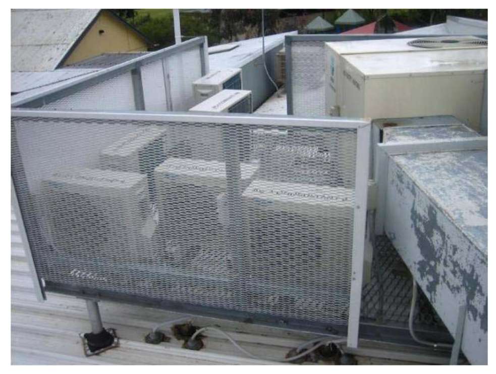
Figure 8: Example of poorly accessible mechanical equipment