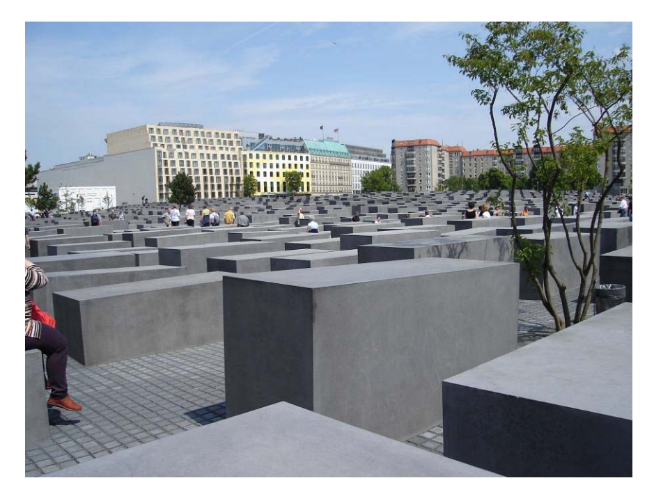
Figure 4: An antigraffiti coating has been used to protect all the concrete 'plinths' of the Holocaust Memorial in Berlin