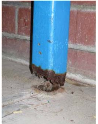
Figure 7: Potential effects of poor corrosion protection.

Incorrect surface preparation or treatment of steel, not in accordance with this standard can lead to surface rusting, which is difficult and costly to repair, or even failure of the material. It is important that site inspections