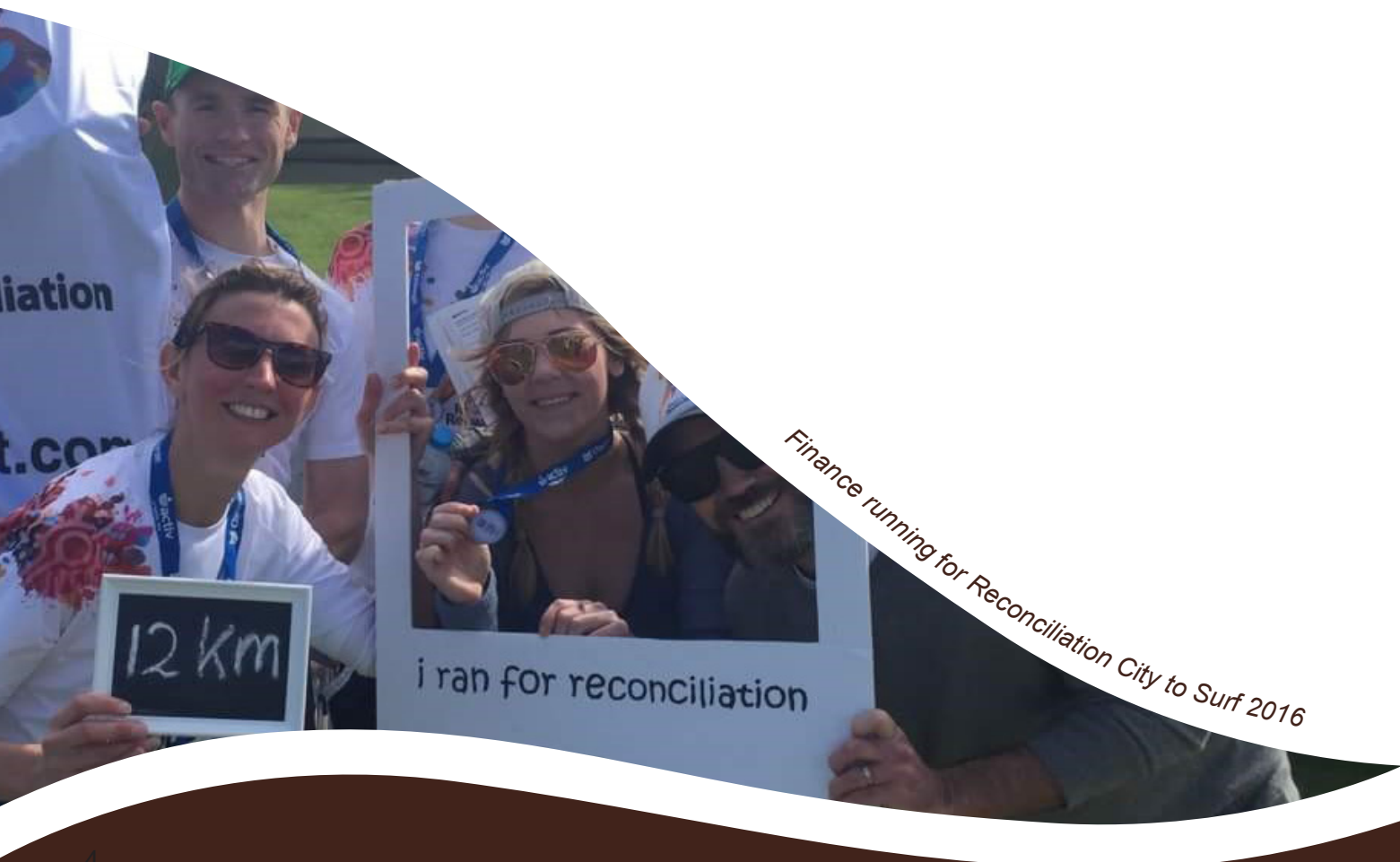
Finance running for Reconciliation City to Surf 2016

As at 30 June 2017, Finance employed 980 Full Time Equivalent (FTE) and is looking at ways to increase employment of Aboriginal people from its current 0.4 per cent of total FTE.