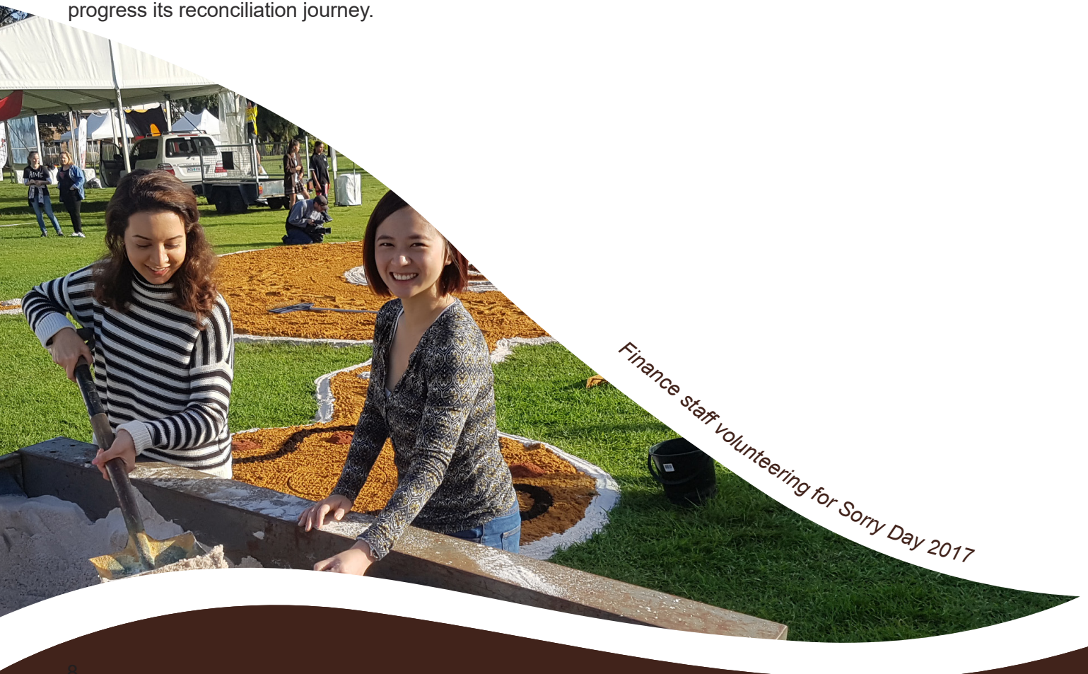
Finance staff volunteering for Sorry Day 2017

Volunteering for the Bringing Them Home committee gave Finance a chance to show its support and progress its reconciliation journey.