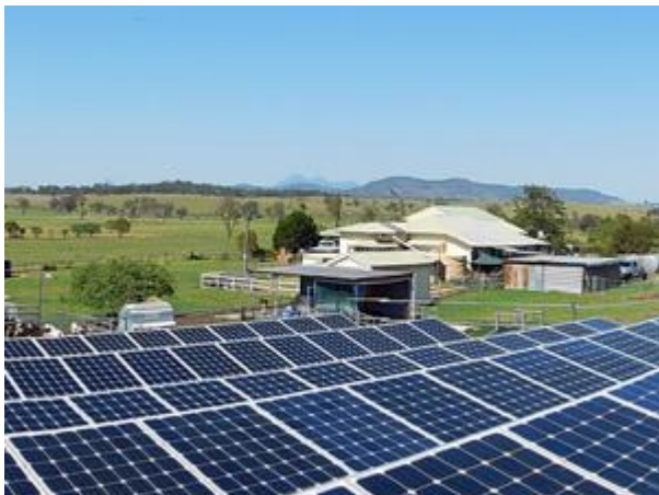
Tamrookum Australia - 77.1 kW, December 2015 - Vogel Solar & Electrical