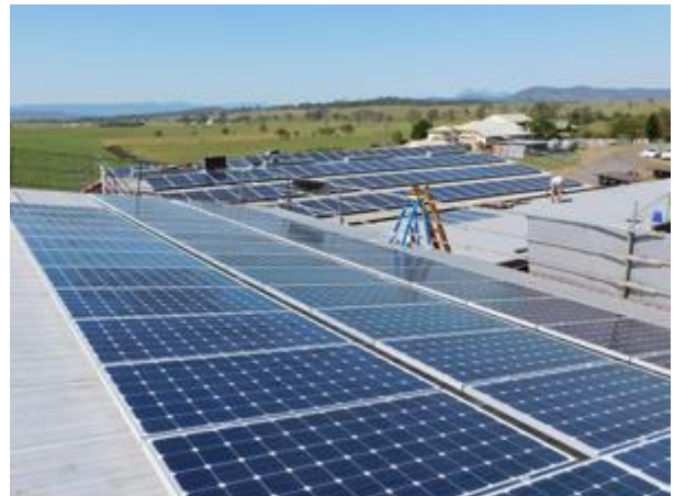
Tamrookum Australia - 77.1 kW, December 2015 - Vogel Solar & Electrical