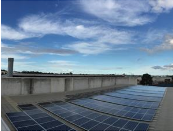
Banyo Australia - 80.4 kW, January 2016