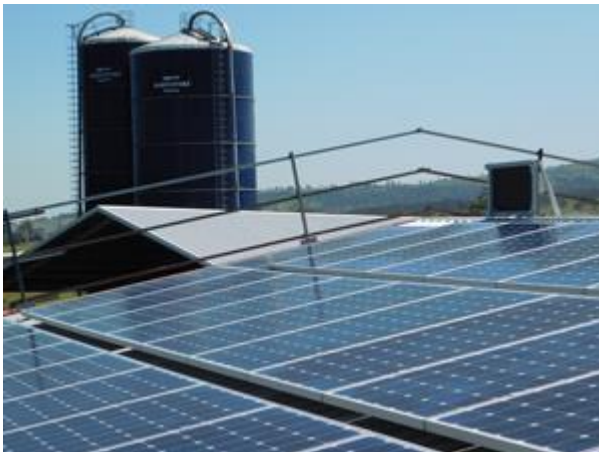
Tamrookum Australia - 77.1 kW, December 2015 - Vogel Solar & Electrical