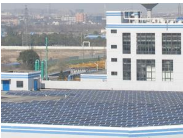
China - 1.4 MW - February 2015