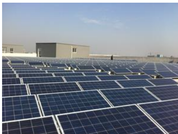
China – 460 kW - March 2015