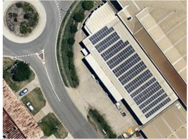
Banyo Australia - 80.4 kW, January 2016