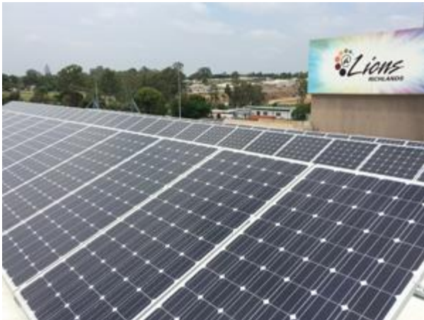
Richlands Australia - 28.8 kW, January 2014