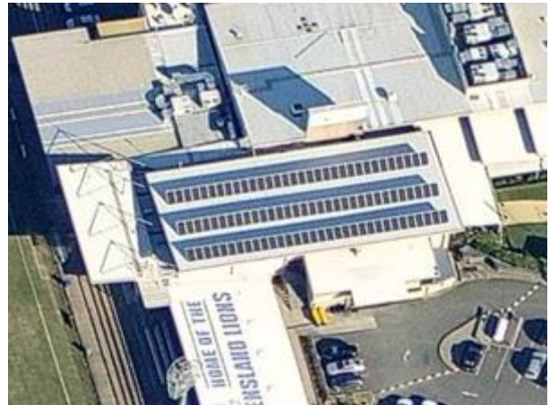
Richlands Australia - 28.8 kW, January 2014