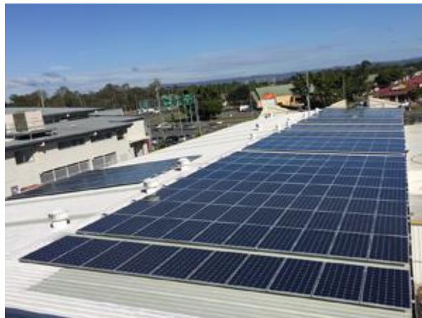
Caboolture Australia – 81 kW, August 2016 - Nuway Solar