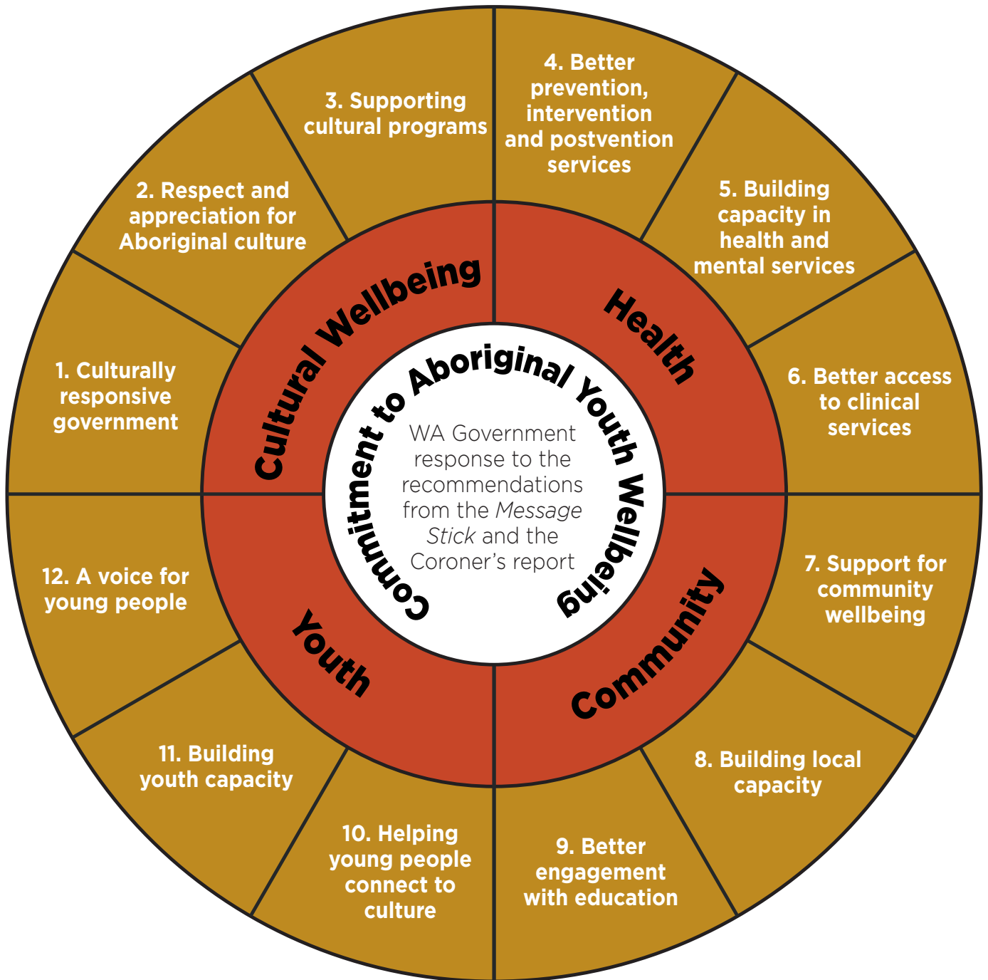
Diagram: the State's commitments to Aboriginal youth wellbeing