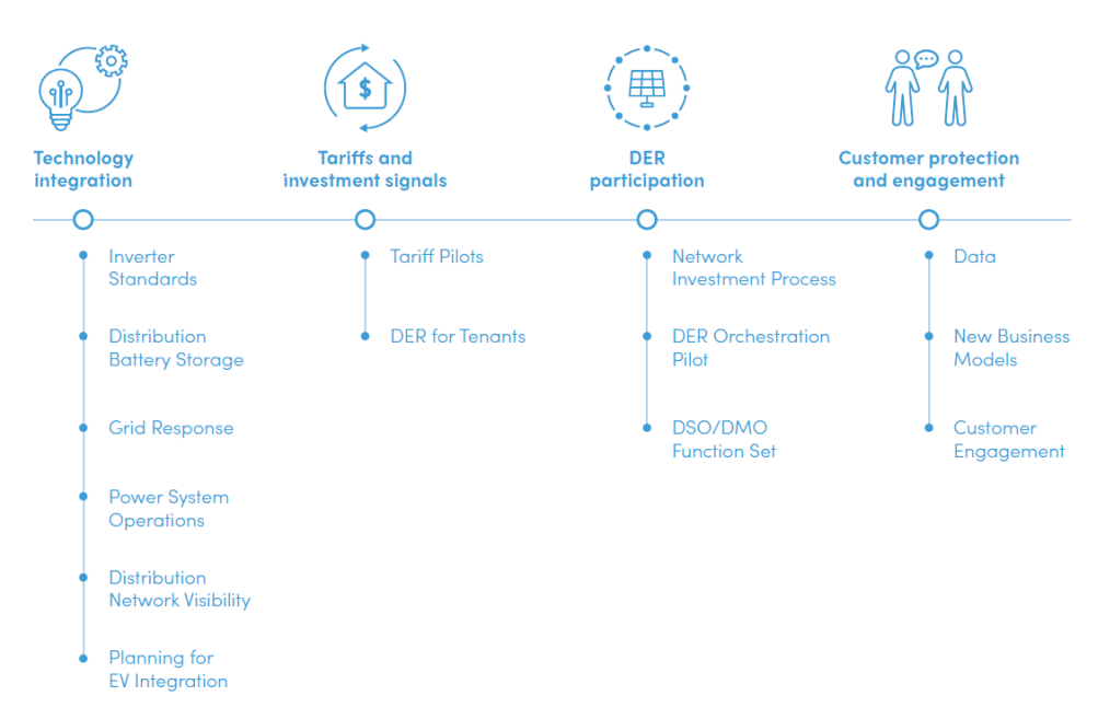
Figure 1: DER Roadmap Elements

Within these elements, the DER Roadmap identifies 36 discrete action items (as shown in Figure 2 below). The 13 action items highlighted in purple are action items that require specific input from AEMO. These action items primarily require regulatory and legislative effort, however in some instances these actions will have capital investment requirements for AEMO (examples include implementing DMO capability and trialling DER orchestration pilots and distribution services markets).