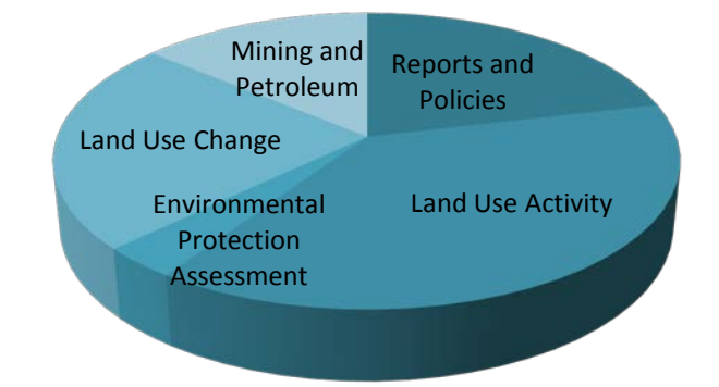
Figure 3: Total statutory referral advice provided state-wide 2015-16

We aim to optimise water resource management outcomes from land development processes of the state. Land planning and resource development proposals are referred to the department through the state's statutory decision making processes. We provide assessment and advice to decision making agencies and proponents of these proposals as shown in figure 3.