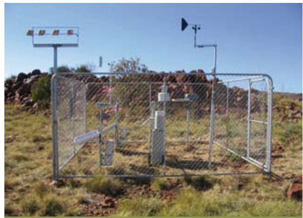
FIGURE 3: An air pollutant monitoring site on the Burrup Peninsula

Measurement of concentrations of air pollutants was conducted at ten sites in 2004/5 and 2007/8, close to and distant from industry on the Burrup Peninsula. A typical monitoring site is shown in Figure 3. The results showed that levels are generally very low, with the exception of atmospheric dust close to port loading facilities. The