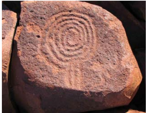
FIGURE 1: An example of the rock art of the Burrup Peninsula

The Burrup Peninsula is also the location of rock art of considerable archaeological and cultural significance. The images have been created by Aboriginal people over many thousands of years by pecking and/or engraving into the surface-weathered coat of the rocks (Figure 1). These petroglyphs have cultural significance for the local Aboriginal people, as well as being of archaeological importance at national and international levels. The rock art is important to the regional, State and national heritage and the Burrup Peninsula, as a part of the Dampier Archipelago was included on the Federal Government's National Heritage List in 2007.