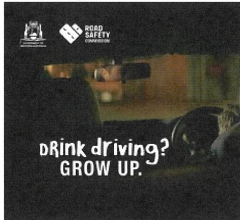
Image 1: Image from the Grow Up Campaign, Road Safety Commission, 2019

Campaigns targeting drink driving continue to be developed and run by the Road Safety Commission. Recent examples Worried (November 2017-February 2018), Priorities – Drink Driving (November 2016-July 2017) and Grow Up (2019/20), can be located at the Commission's website Campaigns Page.