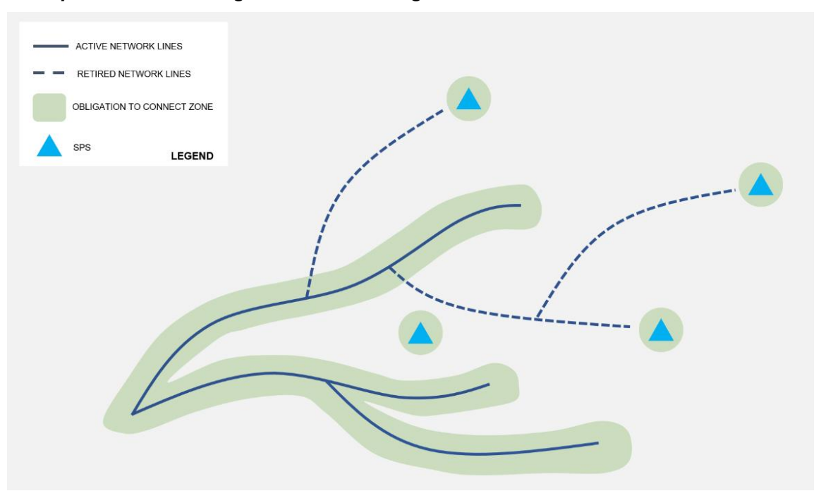
Figure 1: Footprint of the OTC Regulations if no change is made