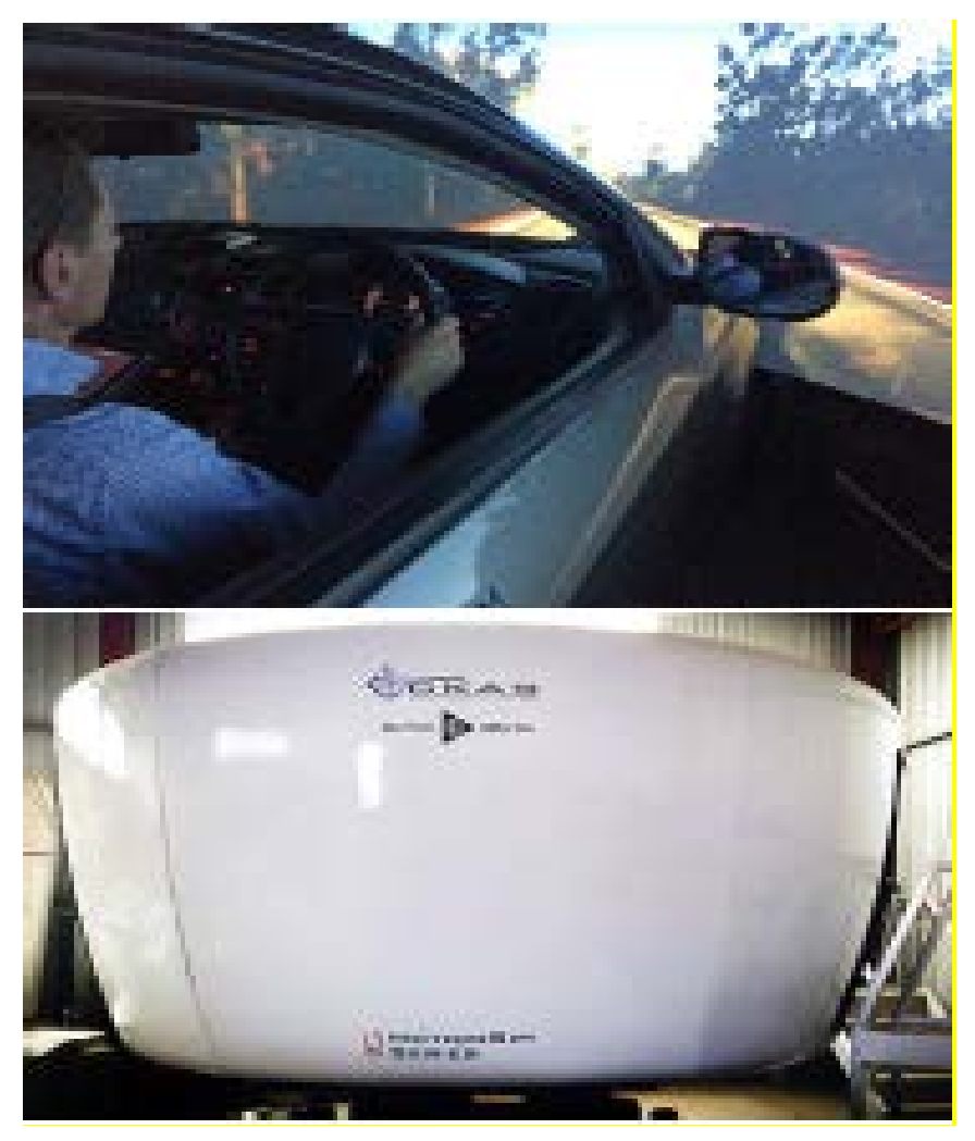
Figure 4.1: The C-MARC-ARRB simulator