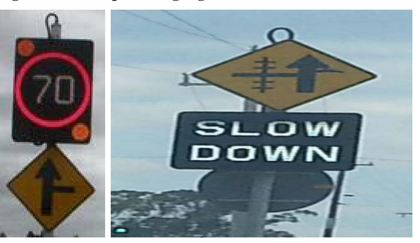
Figure 3.1 Examples of signage used in the NZ RIAWS trial