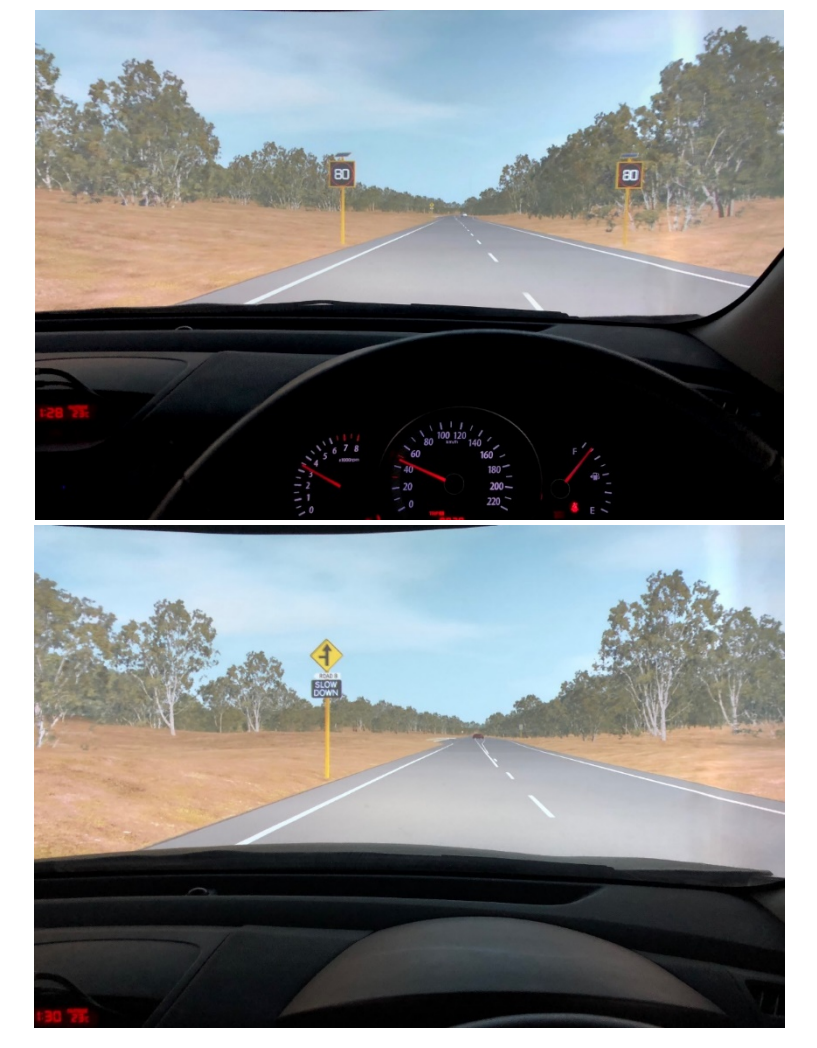
Figure 4.2: Electronic RIAWS 80 km/h speed limit sign and RIAWS slow down sign