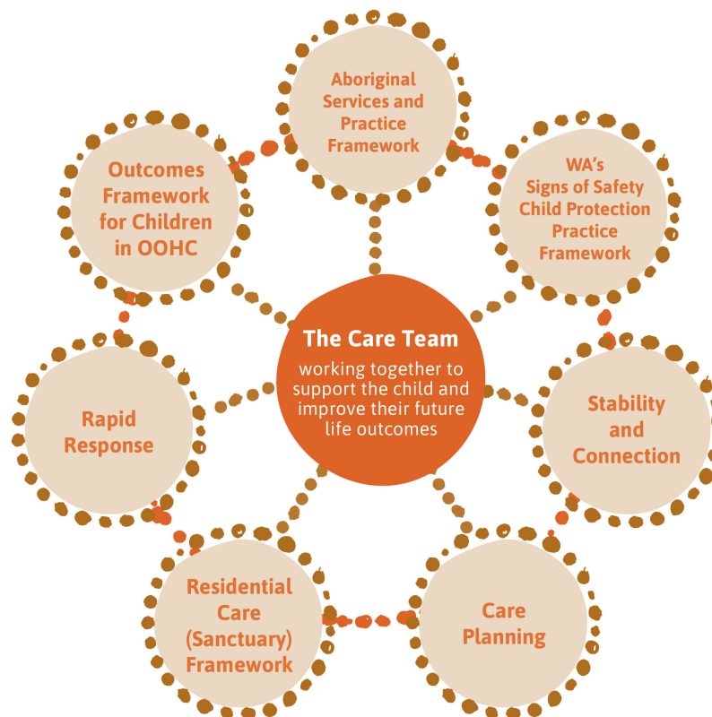
Figure 1: Guiding frameworks and policies

There are a range of other Department frameworks and publications that complement how Department staff work together with all stakeholders to support children in OOHC to have improved life outcomes. These include: