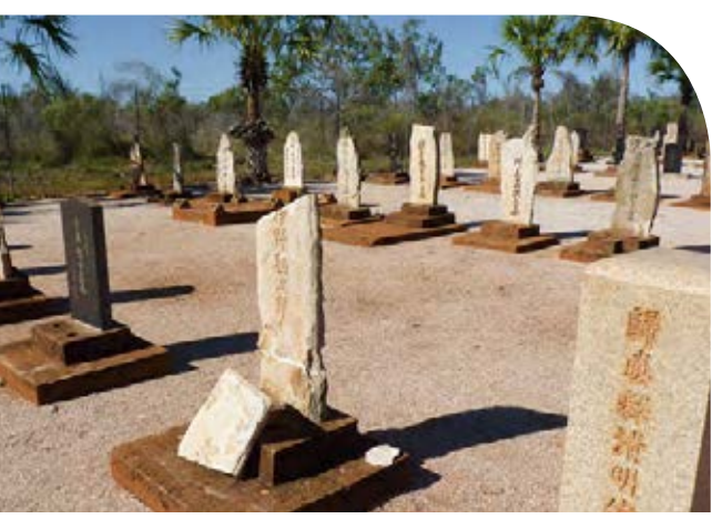
ABOVE: Broome Cemetery – Japanese, Chinese, Muslim Section (1890)

Entry in the State Register means that any changes or works proposed for the place need to be referred, usually by the responsible local government, to the Heritage Council for advice.