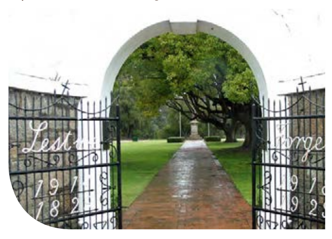
ABOVE: Soldiers' Park, Collie (1921)

The State Register of Heritage Places was established by the Heritage of Western Australia Act 1990 to ensure that places are recognised for their value and importance to the State, and to promote their conservation into the future. It continues to be expanded under the Heritage Act 2018 .