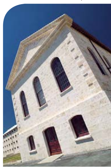
ABOVE: Fremantle Prison, Fremantle (1852) - World Heritage Listed site, 2010 and 2011 Western Australian Heritage Award winner

Each agency has its own set of criteria for entry on its lists. More information on the different heritage lists is available from the Department of Planning, Lands and Heritage website www.dplh.wa.gov.au