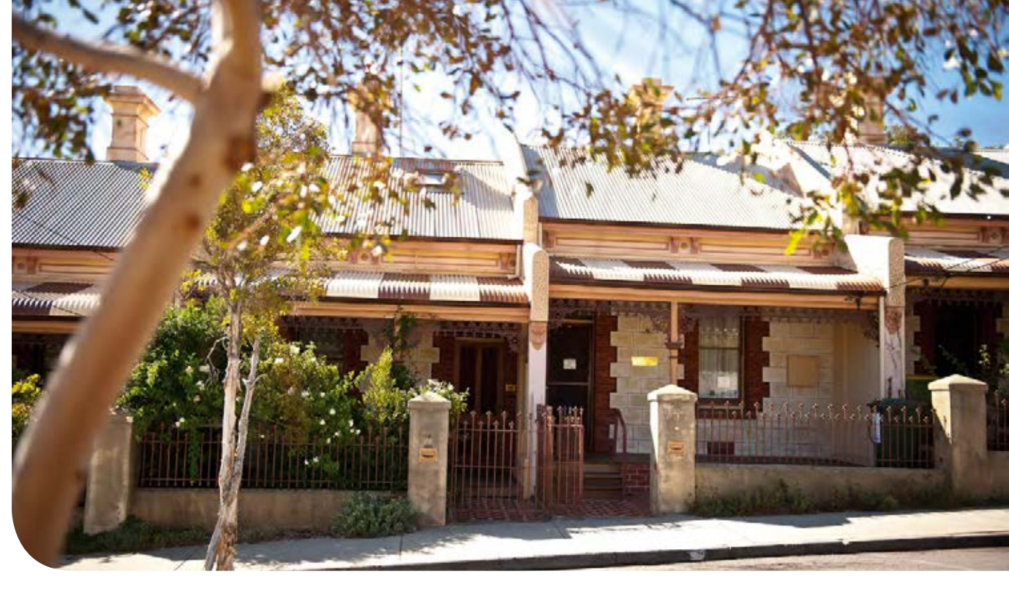
ABOVE: Seven Terrace Houses, Fremantle (1886)