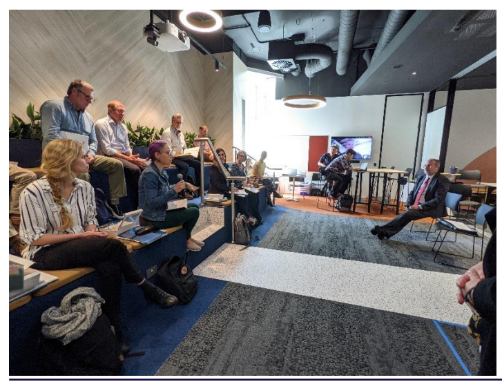
Energy Consumer Advocacy Training Workshop Feedback