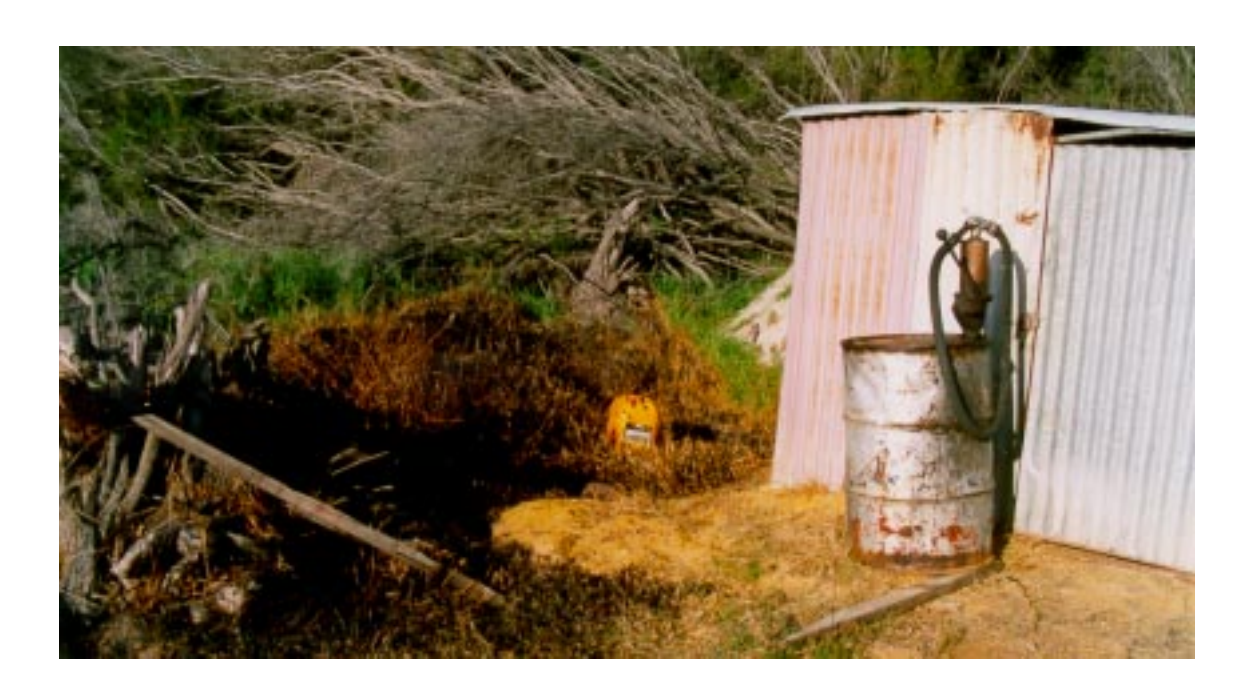
Plate 3. Potential contamination threats to the wellfields.

A circular protection zone of 300 m radius, centred at each well, should secure the immediate wellfield.