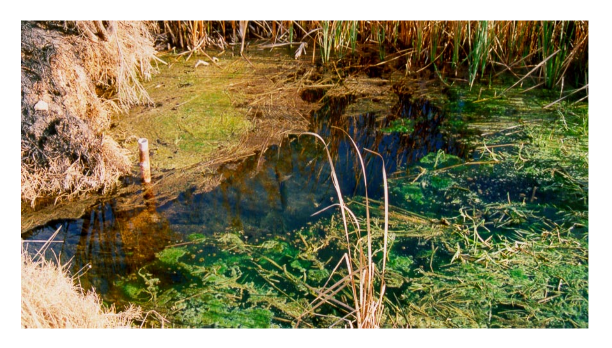
Plate 2. Algal growth within the Yenart soak.

Personnel who deal with WESTPLAN - HAZMAT incidents within the area should be given ready access to a locality map of the Water Reserve. These personnel should receive training to ensure an understanding of the potential impacts of spills on the groundwater resource.