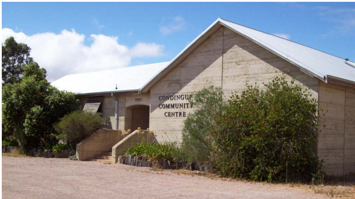
Photo 3 Condingup Community Centre