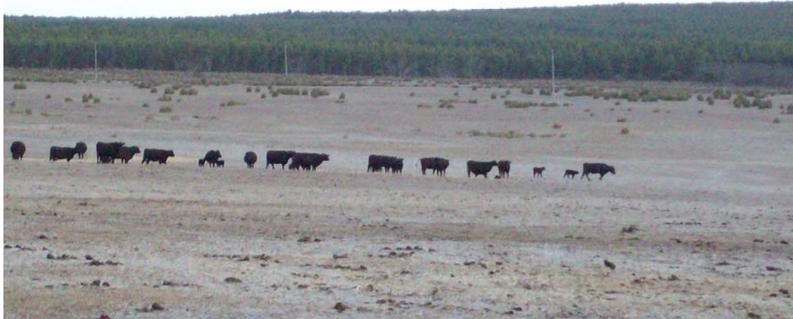
Photo 2 Typical broadacre agriculture activities in Condingup Water Reserve (note cattle grazing with plantation forestry (silviculture) in the background)