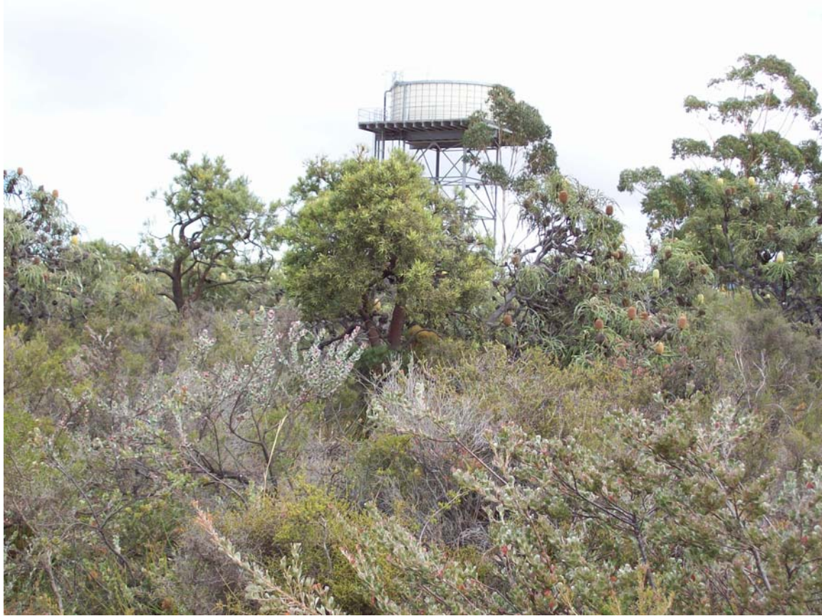
Photo 1 Banksia woodland on crown land adjacent to production bore 6/83 (note elevated water supply service tank in the background)