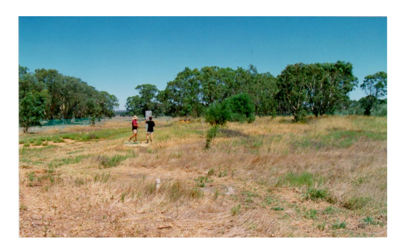
Plate 3. The Water Reserve is surrounded by land used for stock grazing.

The low risks associated with the existing agricultural land uses are considered acceptable for maintenance of water quality.