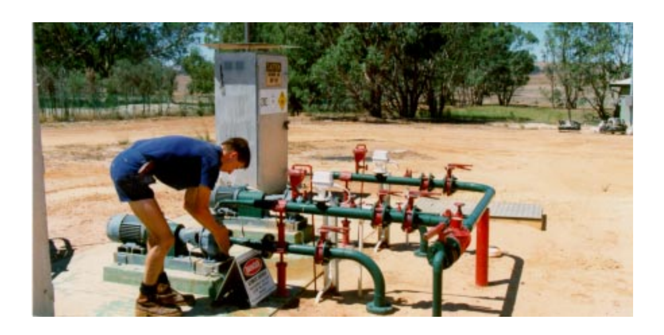
Plate 1. Bores drilled into the Leederville aquifer (shallow spears in background).

As the aquifers are unconfined in the Dandaragan area and the depth to water is relatively shallow, they are considered to be vulnerable to contamination.