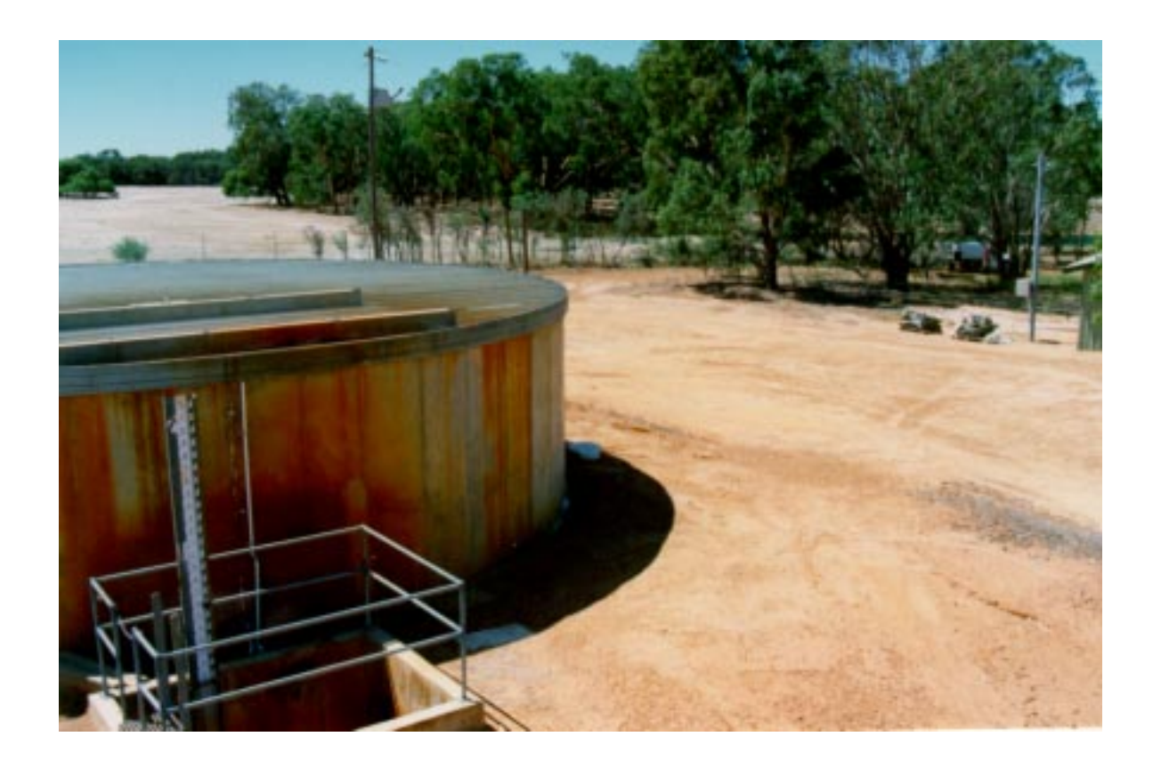
Plate 2. Water pumped from the Dandaragan wellfield is chemically treated and stored in the tank.

All chemical components of the water from the production bores, with the exception of iron levels in bore 1/82, are within the current Australian Drinking Water Guidelines (NH&MRC and ARMCANZ, 1996).