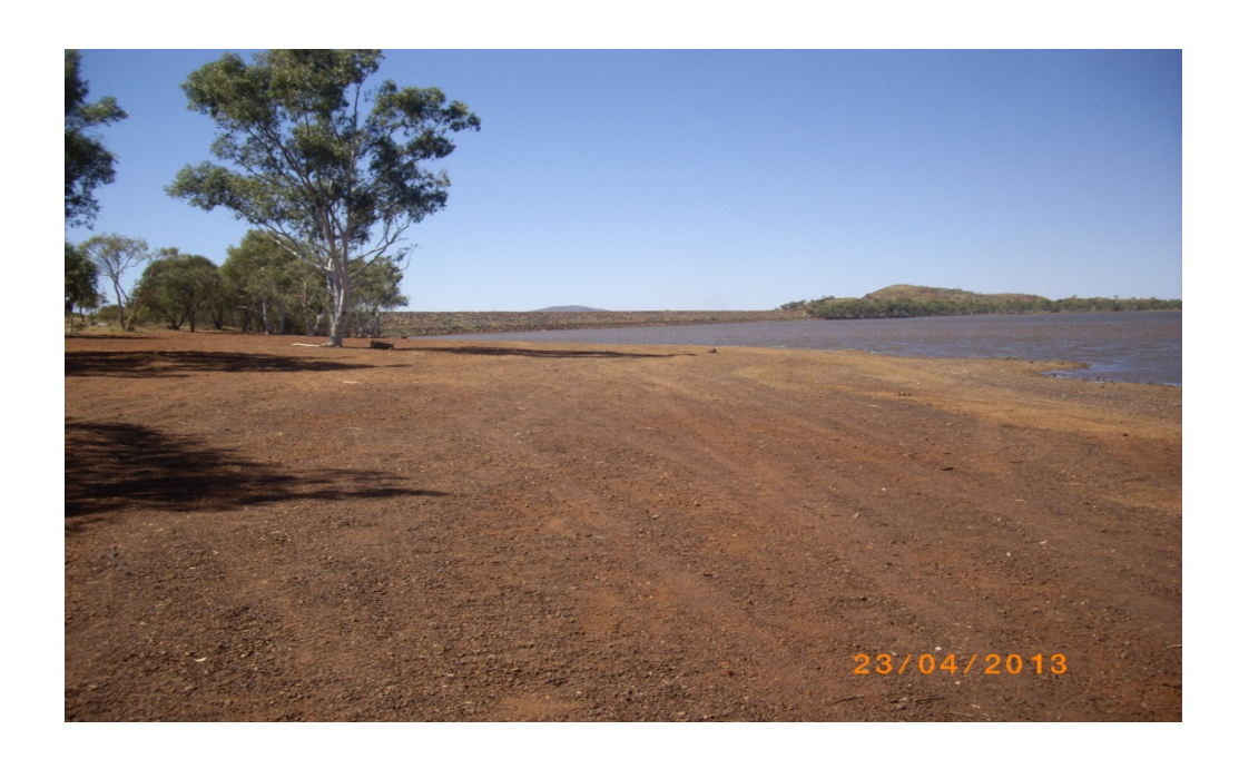
Figure B2 Ophthalmia Dam within close proximity (and upstream) of the E and K line bores in the Ophthalmia Bore field, photograph by N. Mantle