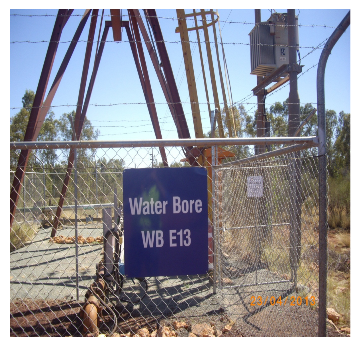
Figure B1 The compound for Production Bore E13 in the Ophthalmia Bore field