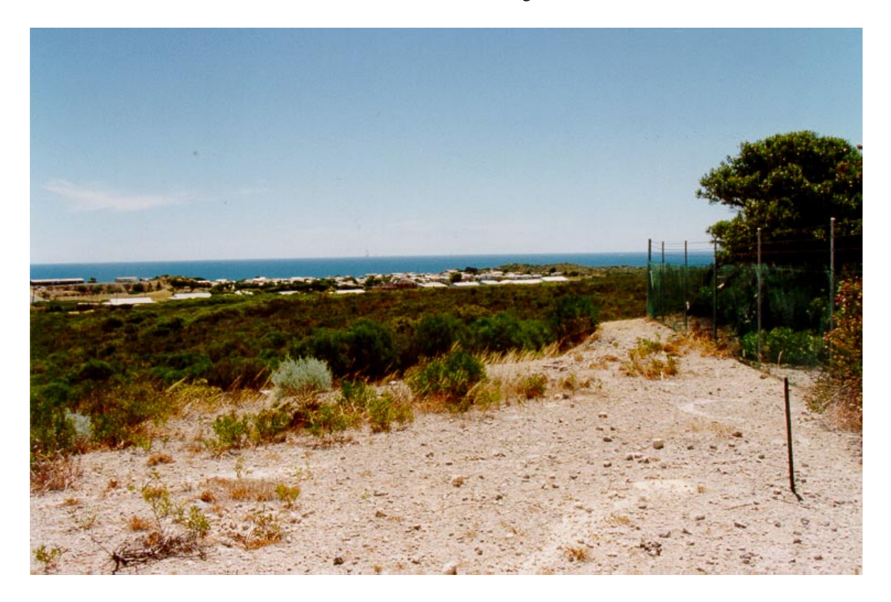
Plate 1: Coastal scrub and urban development surrounding the Seabird wellfield

The Leederville Formation aquifer is confined in the vicinity of Seabird and has a potentiometric surface about 2 metres above ground level. The main recharge area for the aquifer in this region is about 30 kilometres to the east of Seabird where the formation subcrops. The direction of groundwater flow is westerly with groundwater discharging over a saline wedge to the ocean.