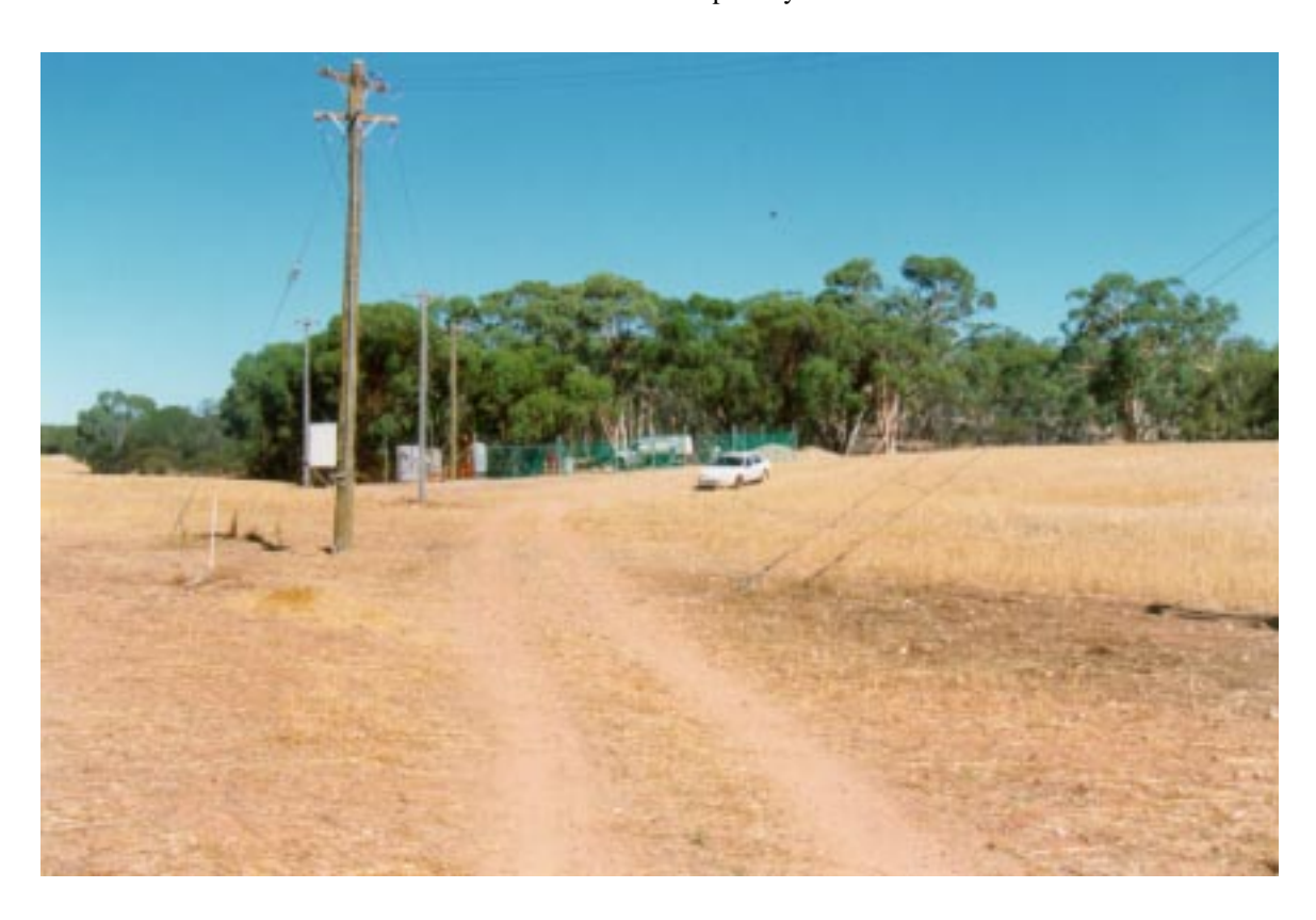
Plate 2. The Watheroo wellfield is located on the privately owned Wrara Station.

The potential for contamination of the groundwater from land use within the proposed reserve is low. The risks associated with the extensive agricultural land use (Figure 2) are considered acceptable for the proposed priority 2 classification of the wellfield.