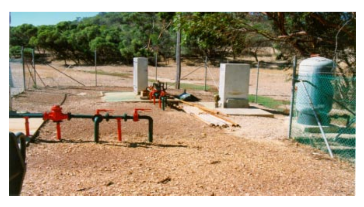
Plate 1. Bores 3/63 and 5/78.

The aquifer is shallow and unconfined, therefore, vulnerable to contamination.