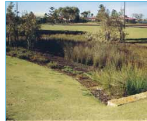
Koombana Cove, Bunbury