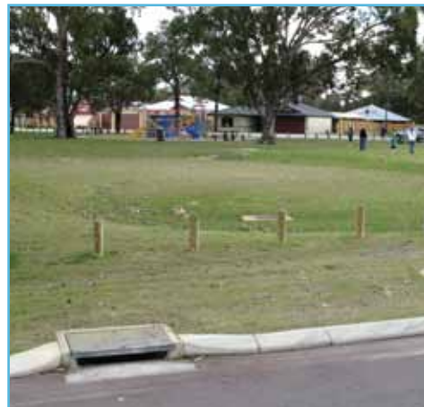
Park and detention basin, Bridgewater South, City of Mandurah