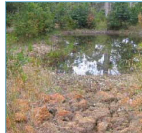
Cowaramup Village, Cowaramup