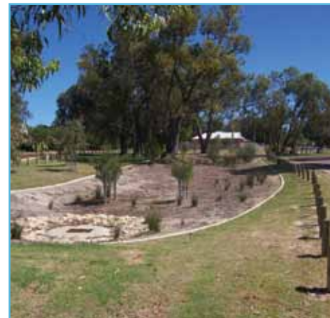
Shallow linear basin, Placid Waters, City of Mandurah