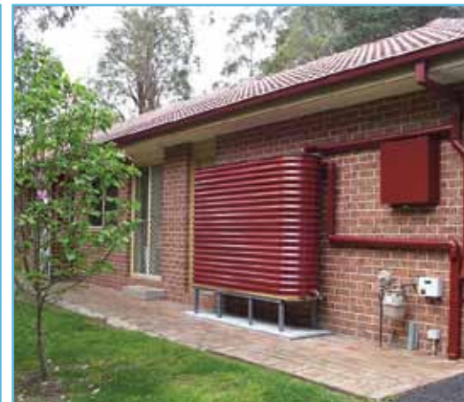
Slimline domestic rainwater tank