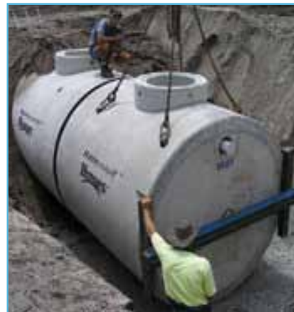
Concrete underground tank