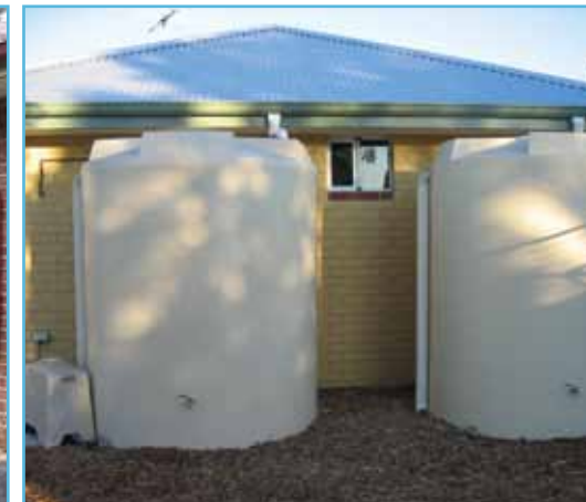
Poly domestic rainwater tanks