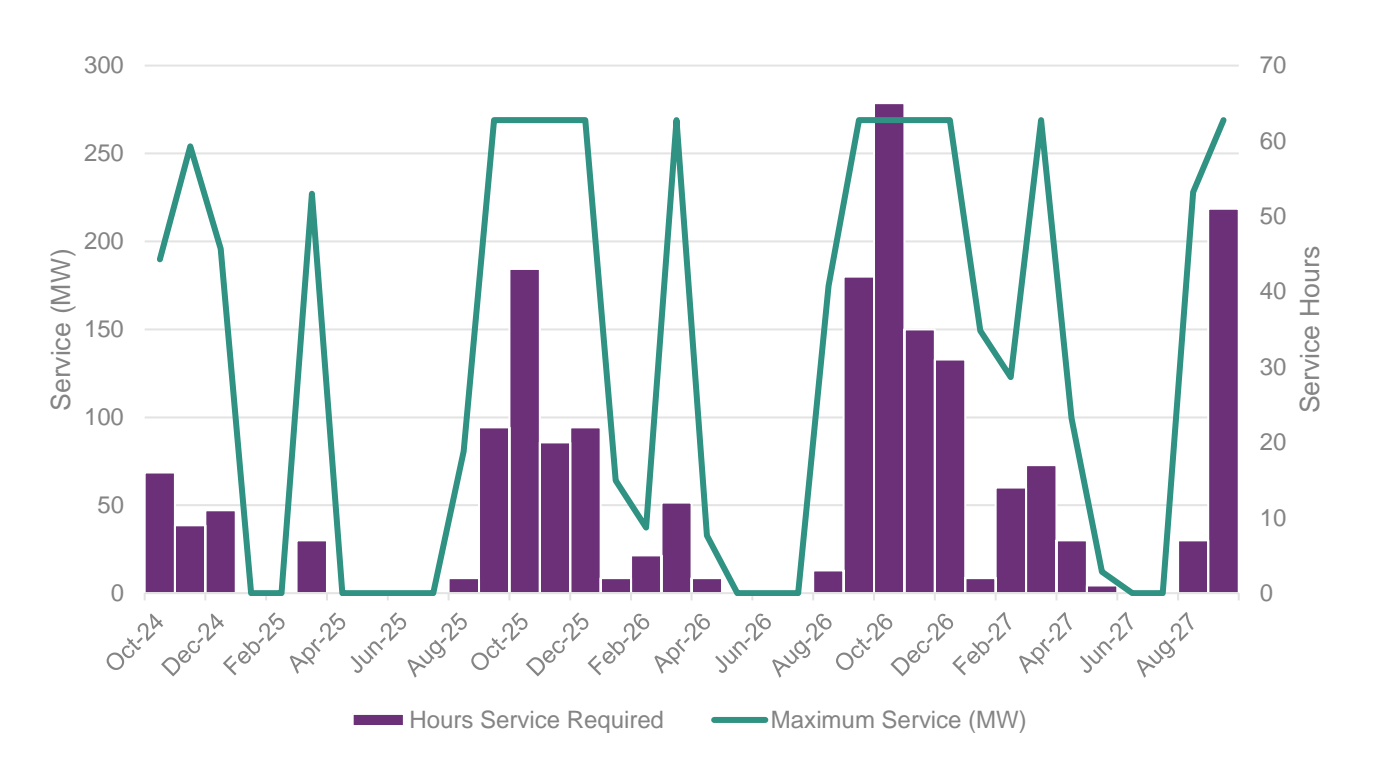
Figure 3 Forecasted hours and MW magnitude of NCESS Service from October 2024