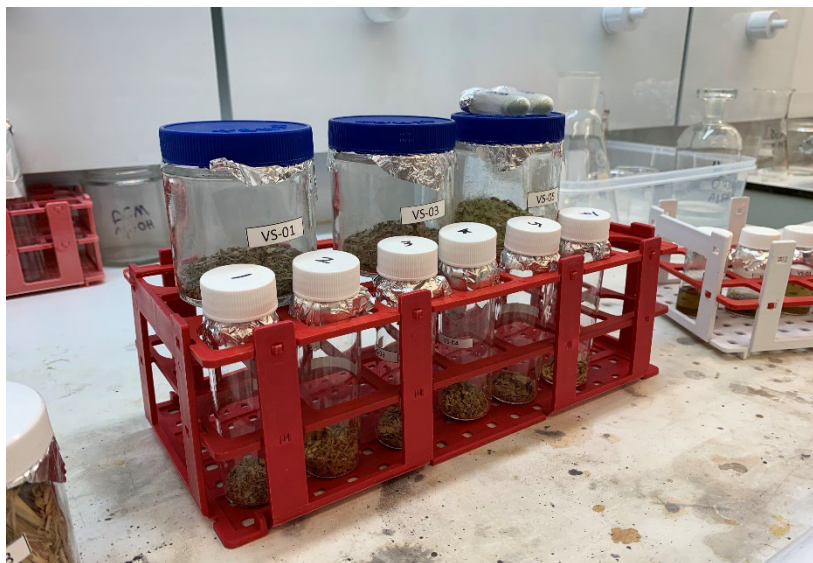
Vegetation samples at the Organic and Isotopic Geochemistry Centre

Following the tour, the Stakeholder Reference Group were briefed by Calibre Group on the progress of field monitoring and laboratory studies in 2022, including the installation of passive air quality monitoring stations and upcoming shoulder season fieldworks.