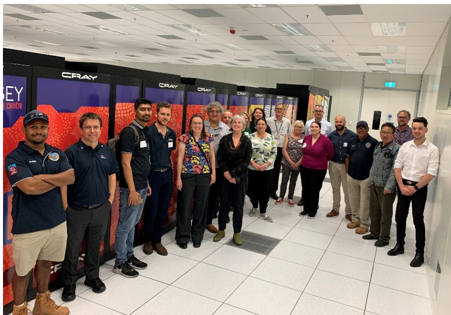
Murujuga Rock Art SRG members, MAC Rangers, and monitoring program team at Pawsey supercomputing centre, 28 September 2022