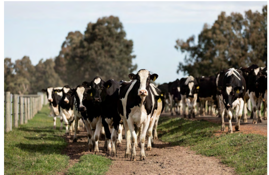
Scrape manure build up on road crossings to avoid impacting other users