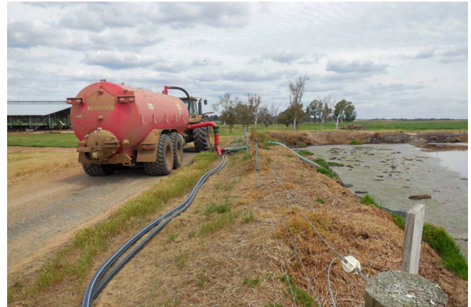
Effluent storages should be emptied by the end of March each year