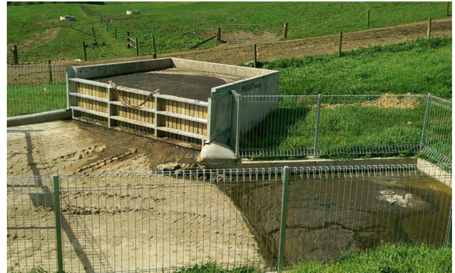
Solids storage bunker with weeping wall directs runoff back to sump