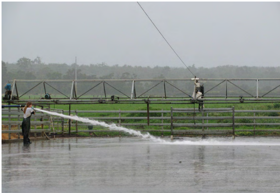
Minimising water use during yard wash reduces the volume of effluent generated each day

Reduced water use and diversion of stormwater from the dairy shed lowers the volume of effluent generated, minimising storage and pumping requirements.