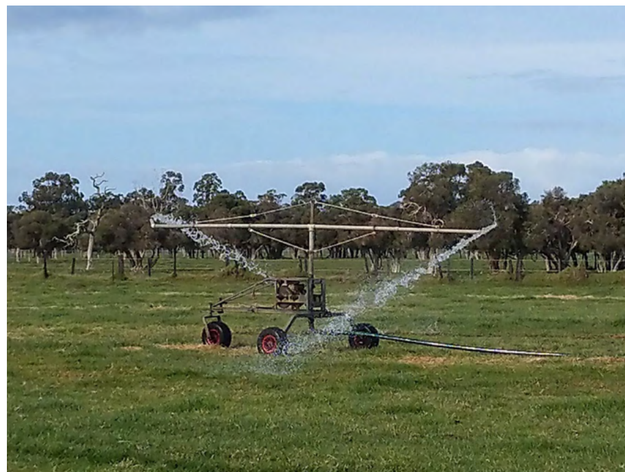
Traveling irrigators are a cost effective method to reuse effluent

Withholding period The minimum period of time that will elapse between applying effluent to pastures and stock grazing those pastures.