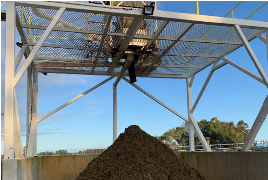
Mechanical solids separators provide dry solids that are easy to handle