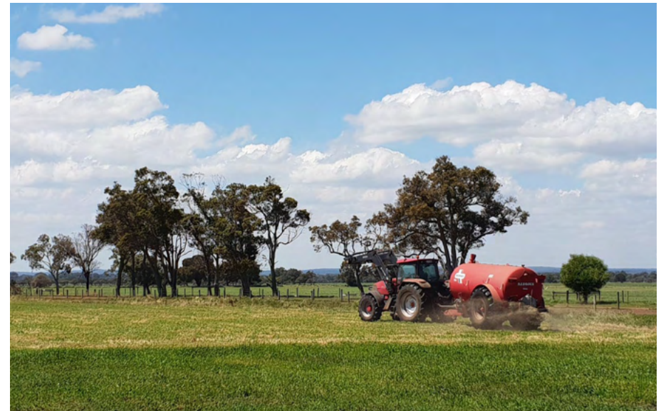
Effluent tanker

Western Dairy would also like to acknowledge all individuals and organisations, including WA dairy farmers, who provided feedback during the stakeholder consultation period and funding through the Regional Estuaries Initiative.