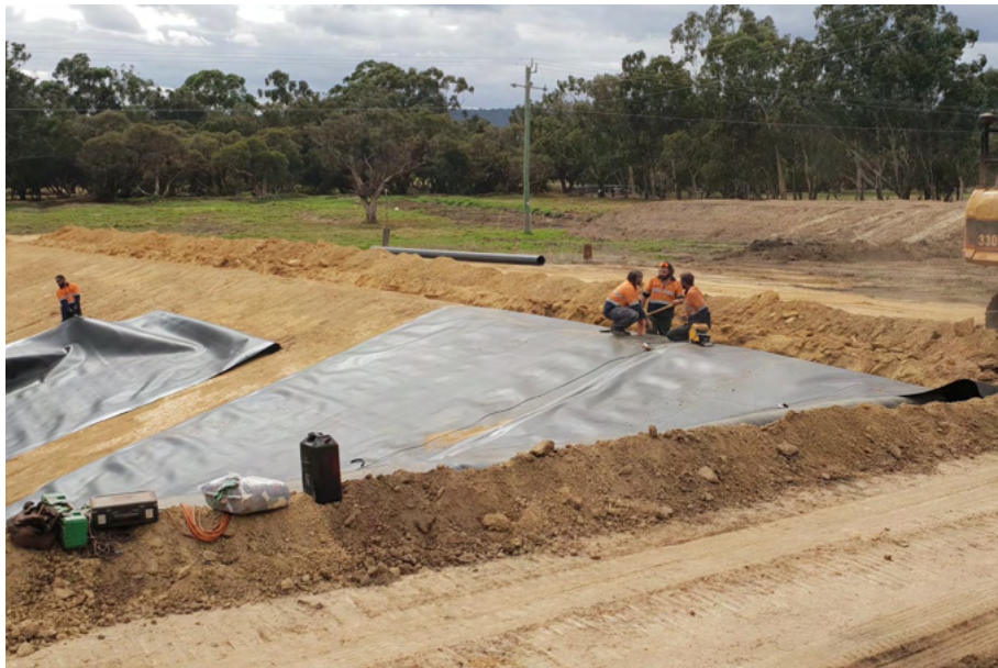
A synthetic pond liner may be required if suitable clay is not available on the farm

Impacts on water quality are minimised by preventing nutrients leaching from effluent storages into groundwater and surface water.