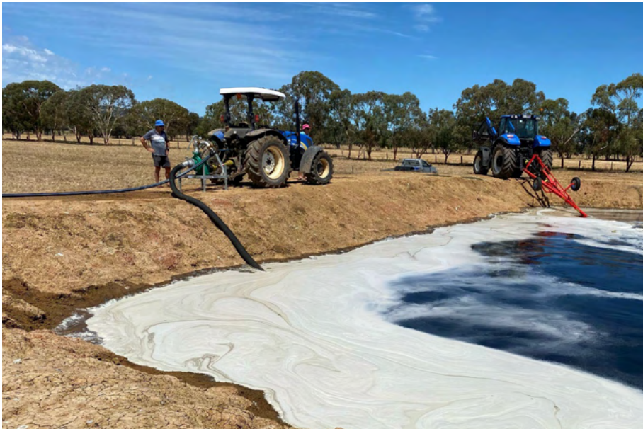
Solids management is required in single ponds to maximise storage capacity over wet periods

Storing effluent during wet periods allows strategic application to pasture or crops at times when nutrients can be better utilised and surface water runoff is minimised.