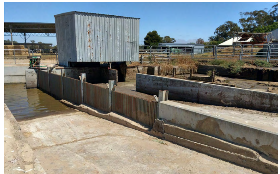
Multi-bay trafficable solids trap