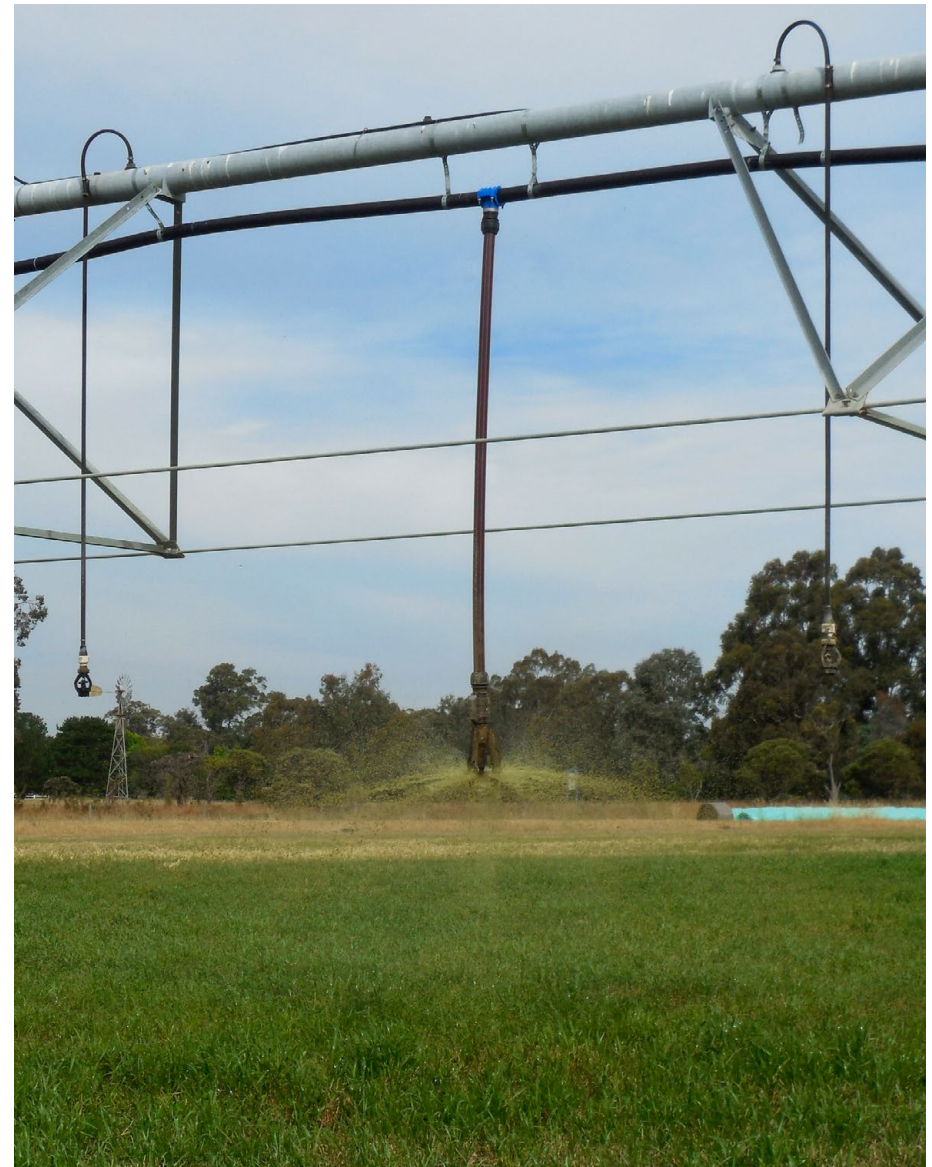
A separate line of nozzles is used to irrigate effluent through a centre pivot