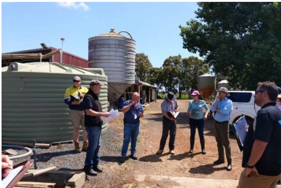
Use a qualified and experienced system designer to develop your effluent management plan

Effluent management plans demonstrate and document that the effluent system design and recommended management will effectively reuse nutrients while minimising impacts on the environment and meet industry standards and best practice.