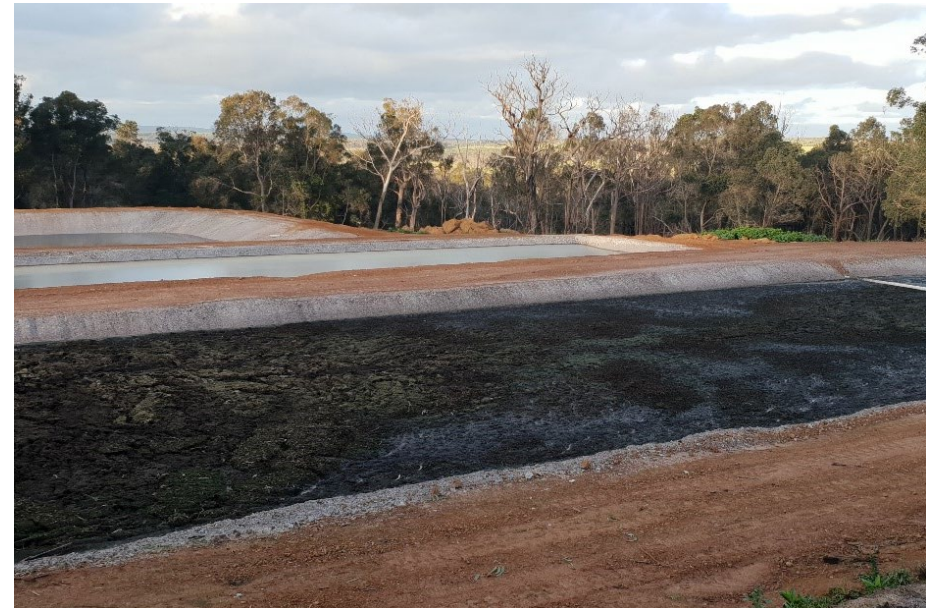
A primary solids pond is a low maintenance option to separate solids and liquids