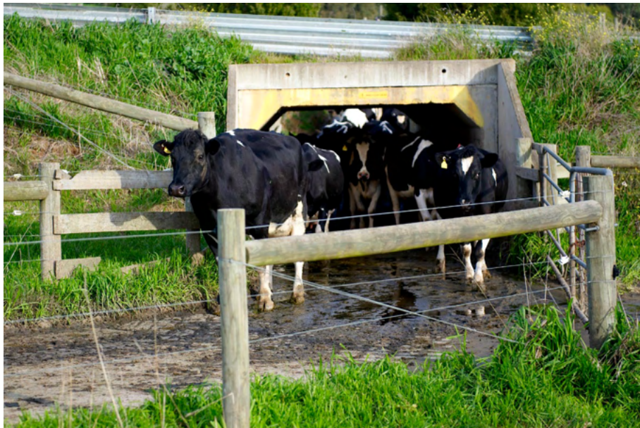
Regularly remove manure that collects on crossings such as underpasses