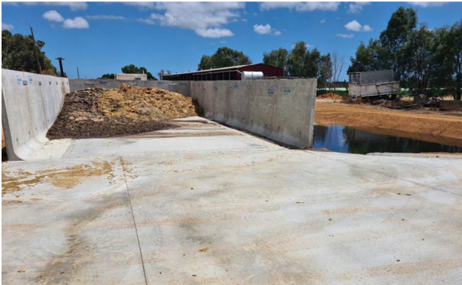
Solids storage pad with stormwater pond

Solids stockpiled on an impermeable surface that drains back into the effluent system to minimise impacts on surface and groundwater.