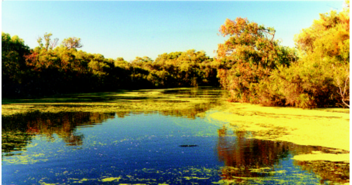
Part of the oxygenated area of the Canning River. Rafts of the floating macrophytes azolla and lemna like this are occasionally seen in summer.

In summary, we can see that oxygenation helps the permanent removal of carbon and nitrogen from the ecosystem, and temporarily suppresses phosphorus release. All of these outcomes help prevent the conditions that lead to the formation of phytoplankton blooms. Anoxic events that result in mortality and the loss of biodiversity through the accumulation of the toxic by-products of anaerobic bacterial processes (eg hydrogen sulfide gas, methane, ammonia) and severe anoxia are also reduced.