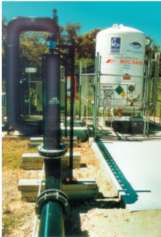
Oxygenation plant on the Canning River. Pipes distributing oxygenated water are in the foreground. Behind them are the oxygen dissolver (left) and liquid oxygen vessel (right).

2) High levels of organic matter entering and accumulating in waterways. Unmodified waterways often have wetlands or dense fringing vegetation that filters out a lot of organic matter before it enters the main waterway. If these mechanisms are removed or decreased in efficiency more organic matter will enter the waterway.