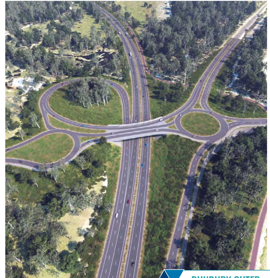
BUNBURY OUTER RING ROAD