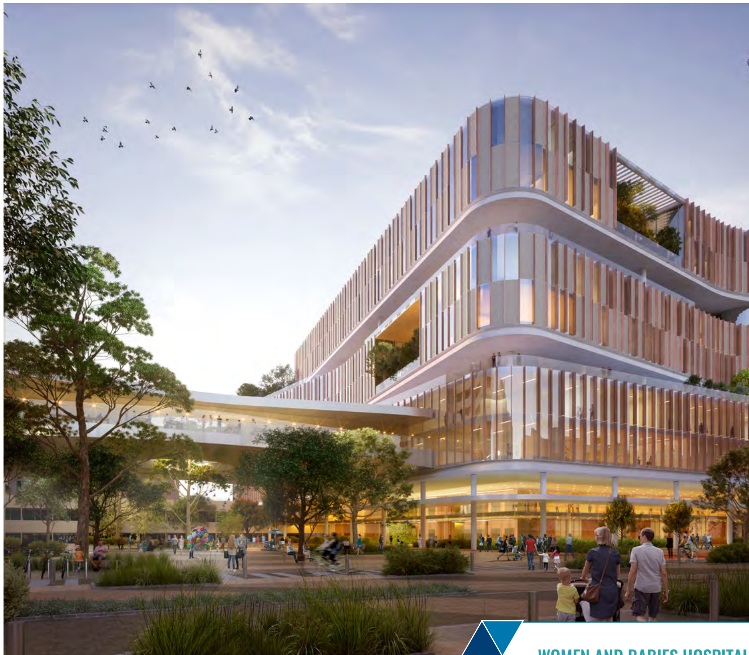
WOMEN AND BABIES HOSPITAL