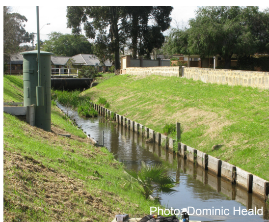
Bayswater Main Drain at the gauging station, August, 2012.