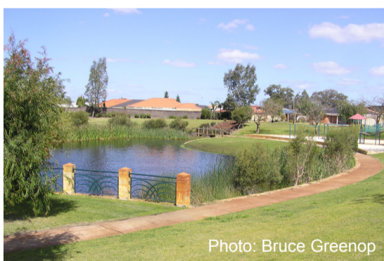
Fountain Park, located on a tributary to Bennett Brook.