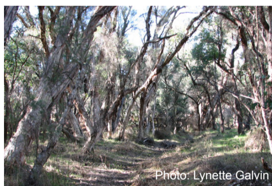
Bennett Brook is ephemeral near its headwaters, drying in summer.