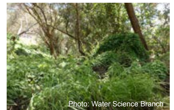
Woodbridge Creek (left); Weeds smothering the vegetation along Blackadder Creek (right).