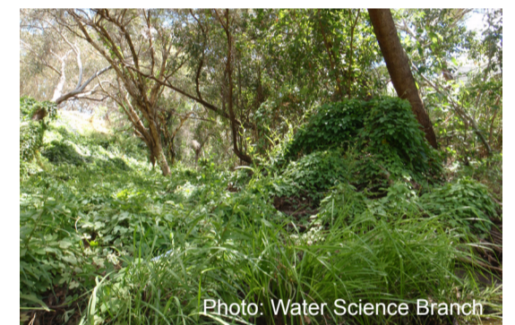
Woodbridge Creek (left); Weeds smothering the vegetation along Blackadder Creek (right).