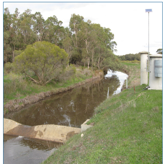
Coolup South Main Drain 613027 – May 2005