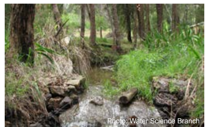
A small rock weir on Jane Brook