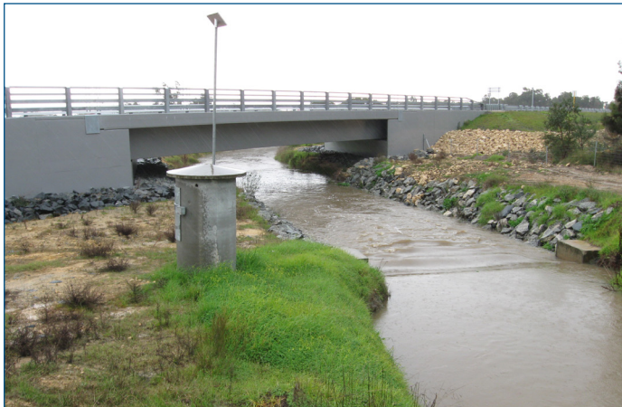
Mayfield Drain - July 2010

The catchment's soils are mostly poorly drained flats and sandy soils containing either ironstone gravel or calcareous mounds. It has the smallest area of leached sands (5.3 km 2 , 4.5%) of all the Peel-Harvey catchments. Nearly a third of the catchment has a high to very high risk of phosphorus loss to waterways (30%).