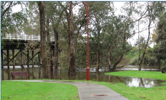
Flooding at Pinjarra, highest flow for the year – August 2009

The sampling site on the Murray River at Pinjarra Road (614065) is one of three long-term monitoring sites within the Peel-Harvey catchment. Nutrients have been monitored at the site since 1983 (except for 1994 and 1995) and flow since 1992. The Murray River flows year-round with river height varying by more than 4 m in some years (e.g. 2009).