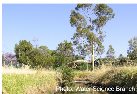
Mills St Main Drain.