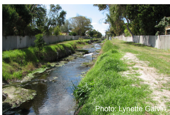
Mills St Main Drain.