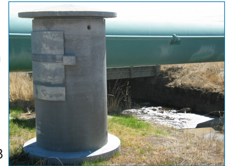
Samson North Drain gauging station at Somers Road - March 2005

The catchment's monitoring site is on Samson North Drain at Somers Road (613014). The drain has been monitored for nutrients since 1990 while flow was measured from 1978 to 1999 and again between 2005 and early 2008. Samson North Drain flows year round.