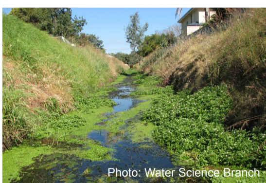
The South Belmont Main Drain showing a large amount of emergent vegetation.