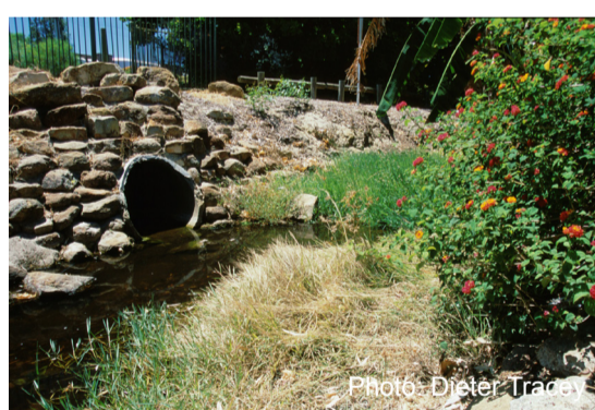
Downstream of the sampling site, with exotic species lining the drain.