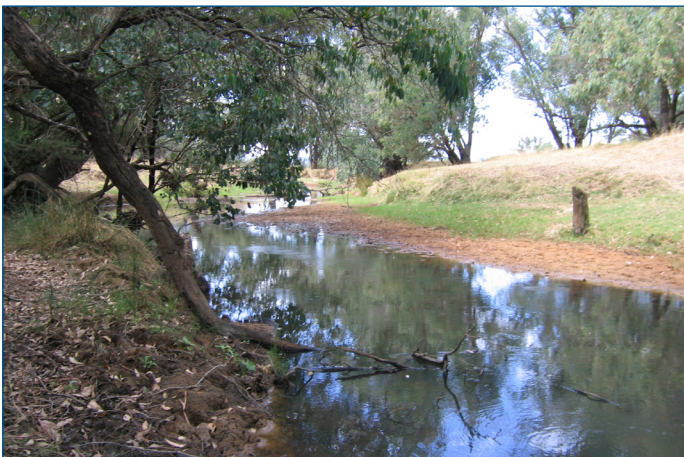
Upstream view of the South Dandalup River at Patterson Road – February 2008