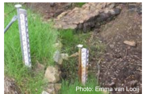
Staff gauges at the catchment sampling site.