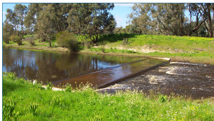
Serpentine River at Dog Hill – August 2001