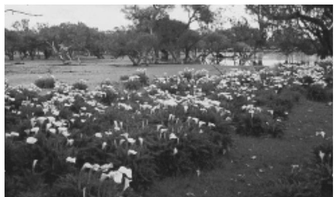
Arum Lily ( Zantedeschia aethiopica ) is a highly invasive weed species.