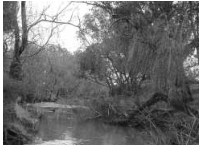
Weeping Willows along the Brunswick River. B. Hughes

The threat to water quality is much greater and more immediate. There is an increasing trend for landscapers of new housing estates to plant deciduous trees throughout the subdivision, leading to a large increase in organic matter entering drainage systems and waterways in late autumn/early winter.