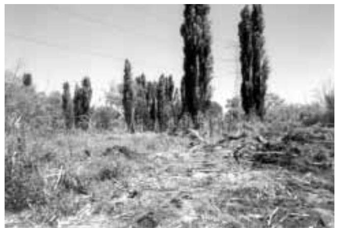
Chilean Willows have spread along Bennett Brook L. Taman in Caversham.

The use of large machinery to remove deciduous trees can result in damage to other flora and to the banks and floodplains of streams and rivers, and should be considered carefully. Mechanical removal is best for the smaller willows such as Chilean Willows, which are shallow-rooted and can be completely pulled out using a vehicle and chain. Care must be taken however to ensure that all broken branches are removed from the site before they take root and resprout.