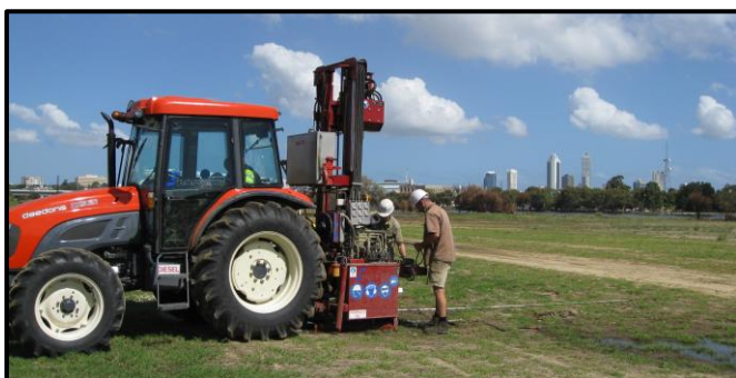
Tractor-mounted sonic drill rig taking core samples as part of DER's ASS mapping program.

The ASS risk maps are accessible via Landgate's Shared Land Information Platform (SLIP). ASS data can be accessed through a number of Landgate's online services, including WA Atlas and Interest Enquiry (see instructions at the end of this fact sheet).