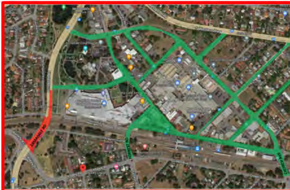
Armadale Road Closure