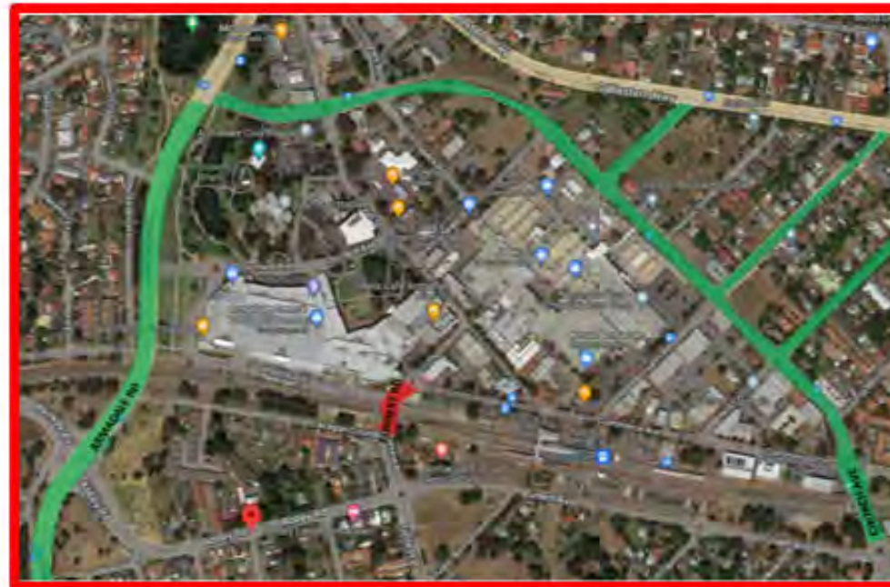
Forrest Road Closure