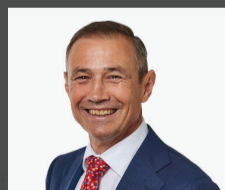
The Hon Roger Cook MLA

I am the current Governor of Western Australia.