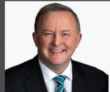
The Hon Anthony Albanese MP

I am the current Governor-General of Australia.