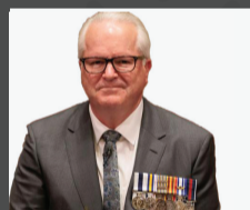
His Excellency the Hon Christopher Dawson AC AMP

I am the current Prime Minister of Australia.