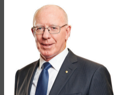
His Excellency General the Hon David Hurley AC DSC FTSE